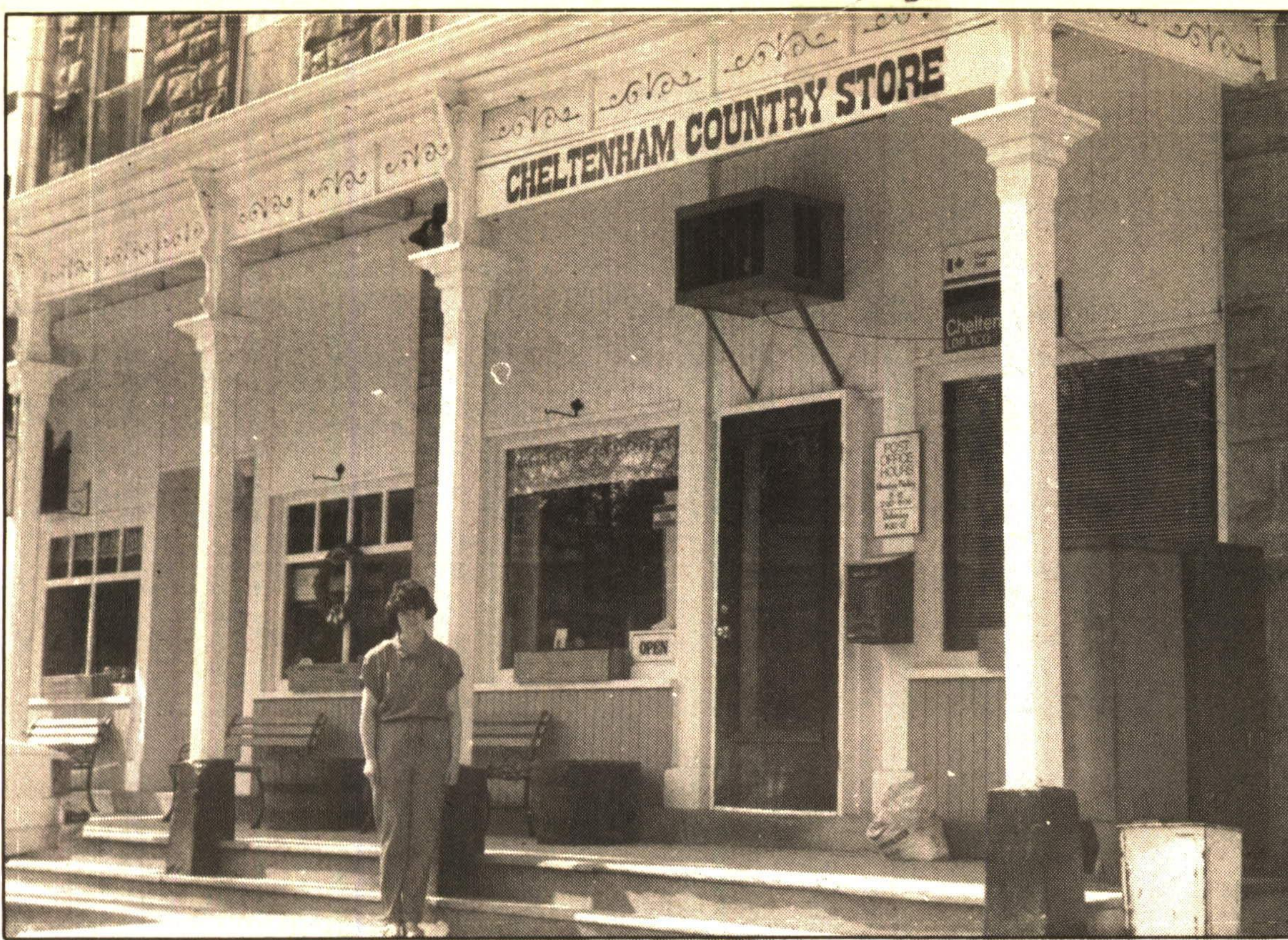
New owner Candis Roussos offers more than just the typical general store items.