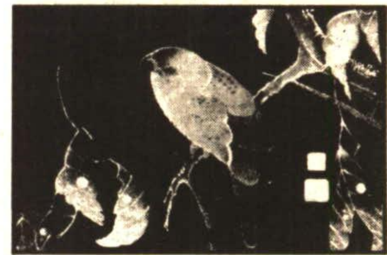
Design featured on a UNICEF card.

Give a child a future. Buy UNICEF all-occasion Greeting cards today.