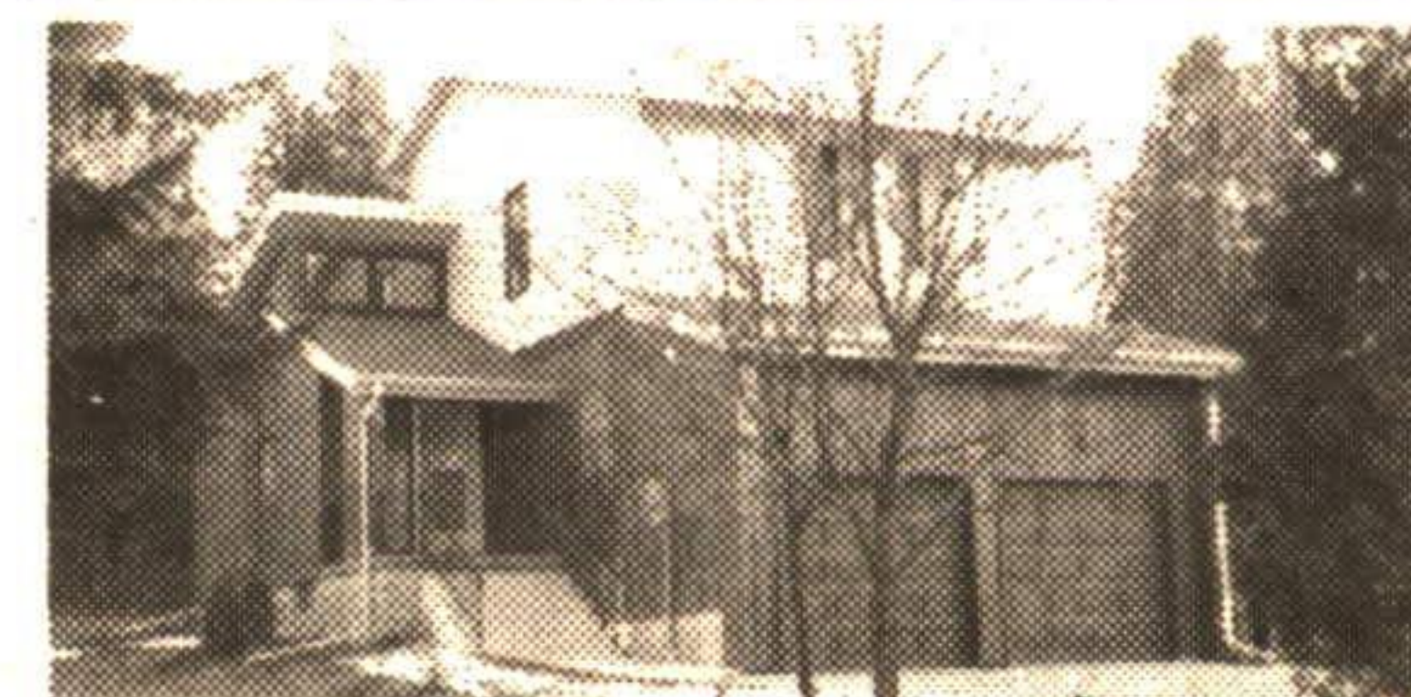
THE SERENITY OF ROCKWOOD