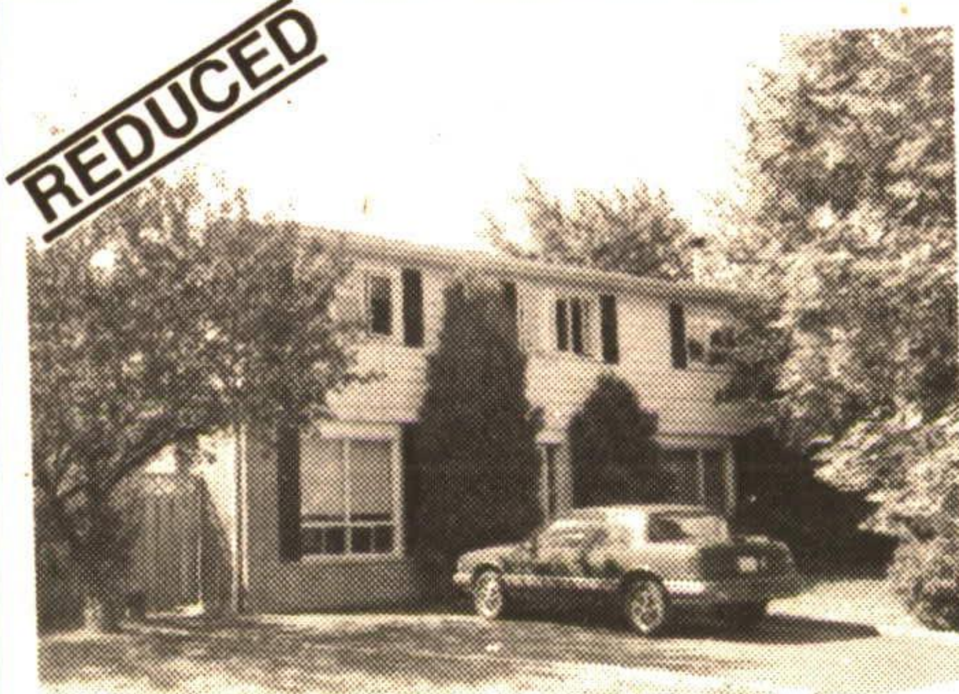
LOVELY 4 BEDROOM HOME ON SPECTACULAR RAVINE - $279,900

This fine home features many upgrades including new custom kitchen, oak pegged floors in living & dining rooms, central air, new windows, finished rec room with fireplace, cedar deck, all new fencing, new patio doors, new driveway and much more. RM9209