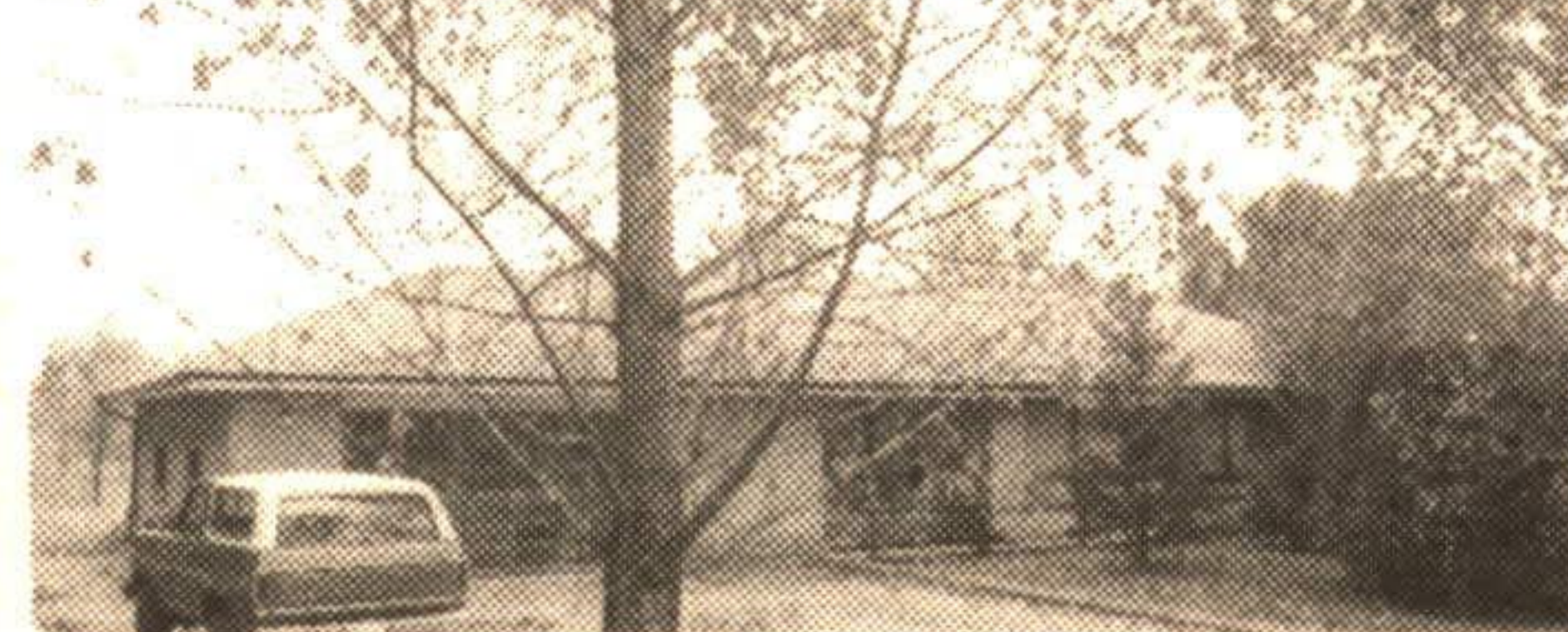
COUNTRY BUNGALOW - GREAT LOCATION $339,900

Constructed with top quality features including 9' ceilings on main floor, oak plank flooring throughout ceramic floor in baths, 2 fireplaces, circular oak staircase, sunken living & dining rooms, main floor family room, triple car garage & much more. RM9300