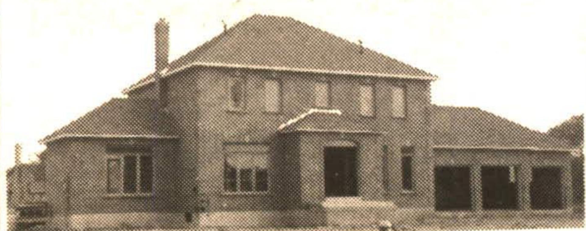
GORGEOUS NEW ESTATE HOME $454,900

Custom quality built 4 bedroom home with 9' ceilings on main floor, all clay brick casement windows, 3 baths, oak circular stairs, 2 fireplaces, triple car garage, sunken living & dining rooms, lovely master suite and much more. RM9148