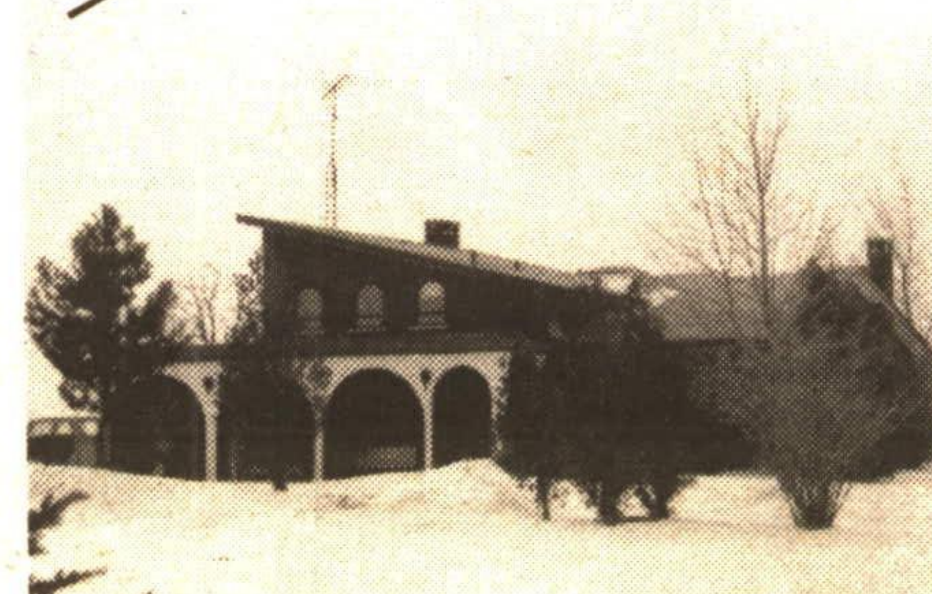
UNIQUE CUSTOM DESIGNED HOME SOUTH OF TOWN

Set on 1 1/2 acres this fine home is located close to Georgetown, Brampton and Hwy. 401. Features include a stunning entry hall with cathedral ceiling & skylight, cozy tudor style main floor family room with brick fireplace and built-in bookshelves, formal separate living & dining rooms, 3 baths, triple car garage & much more. RM056-90