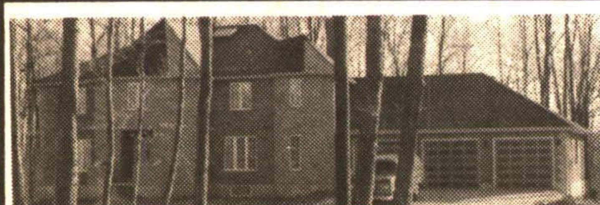
COUNTRY ELEGANCE NESTLED ON WOODED 1-1/2 ACRES!

This fine home features many upgrades including new custom kitchen, oak pegged floors in living & dining rooms, central air, new windows, finished rec room with fireplace, cedar deck, all new fencing, new patio doors, new driveway and much more. RM9209