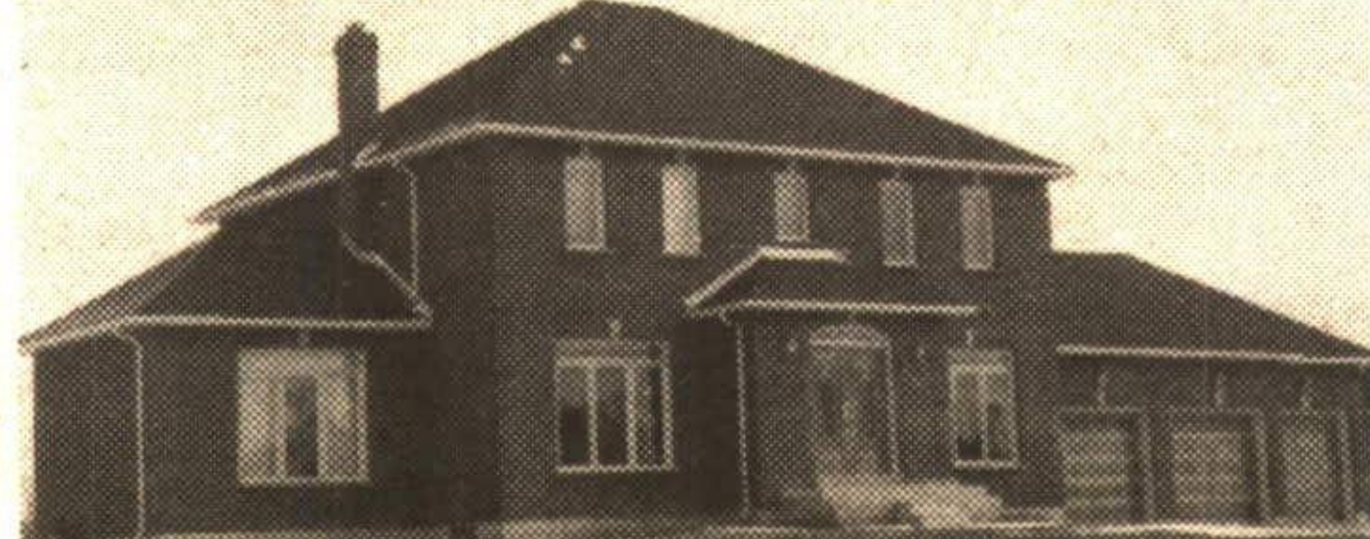
STUNNING EXECUTIVE HOME ON HALF ACRE $479,900

Custom quality built 4 bedroom home with 9' ceilings on main floor, all clay brick casement windows, 3 baths, oak circular stairs, 2 fireplaces, triple car garage, sunken living & dining rooms, lovely master suite and much more. RM9148