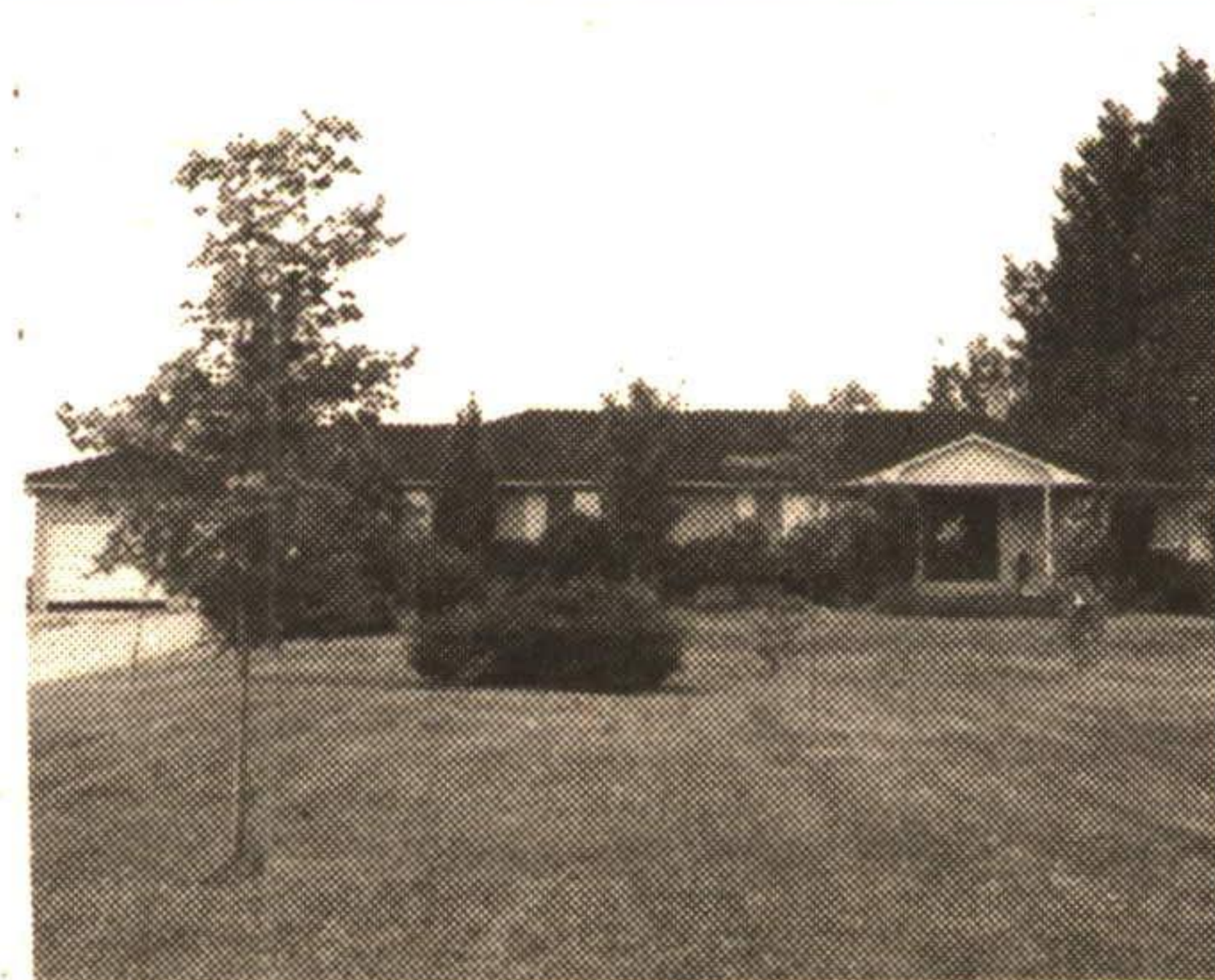
4 BEDROOM COUNTRY BUNGALOW ON 1+ ACRE

This spacious home is approximately 2,400 square feet of living space and includes stone fireplace in family room with walkout to deck, sunken living room with brick fireplace, 3 bathrooms, lovely hardwood floors in living and dining rooms, cosy eat-in kitchen, above ground pool on nicely landscaped property and much more. RM9181