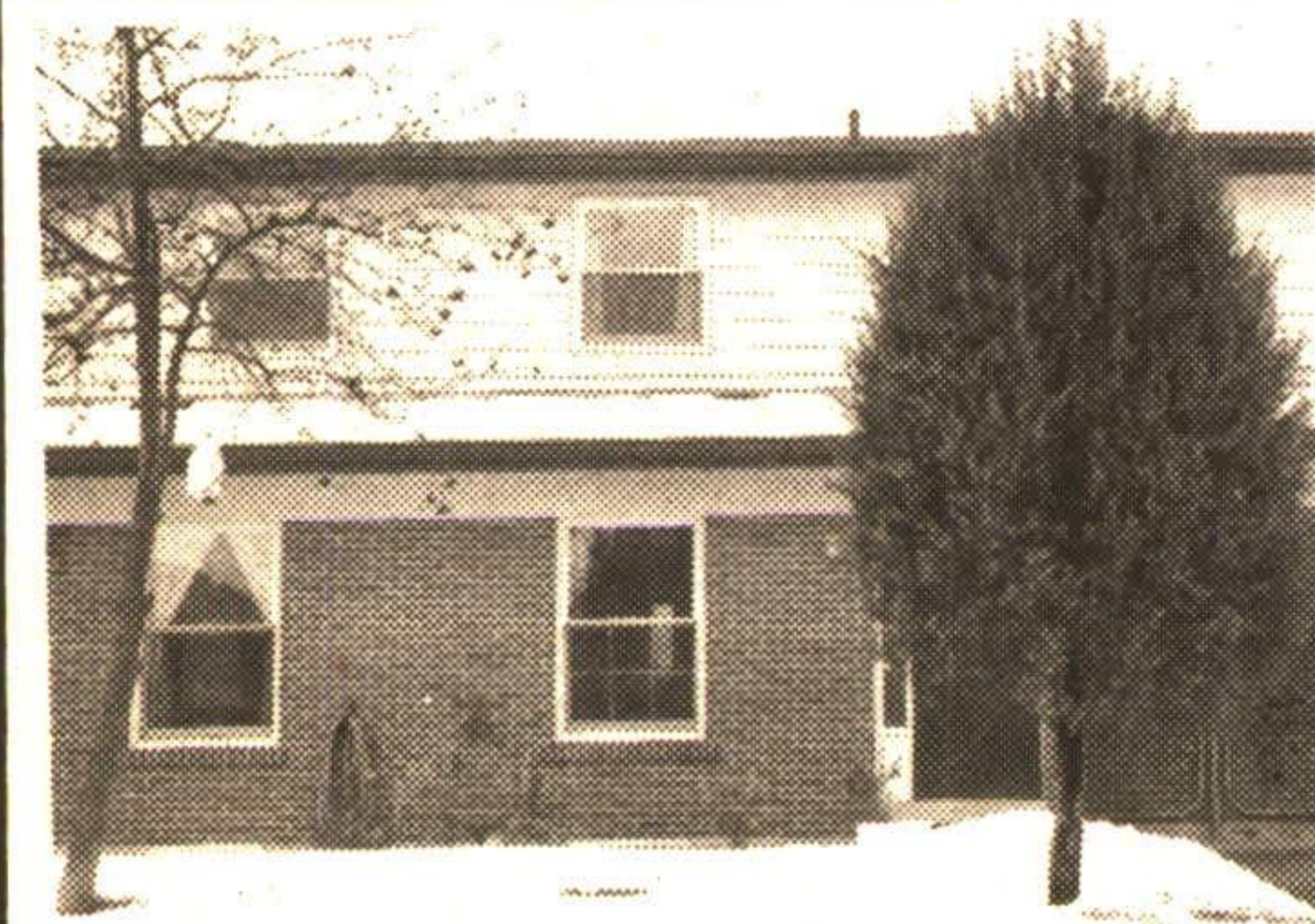
PHASE III TOWNHOUSE $141,000.

Set in the picturesque hamlet of Campbellville this charming home is freshly decorated and features a new kitchen, new broadloom, alum. eaves and soffits, fireplaces in living room, new septic system, new well and more. RM9265