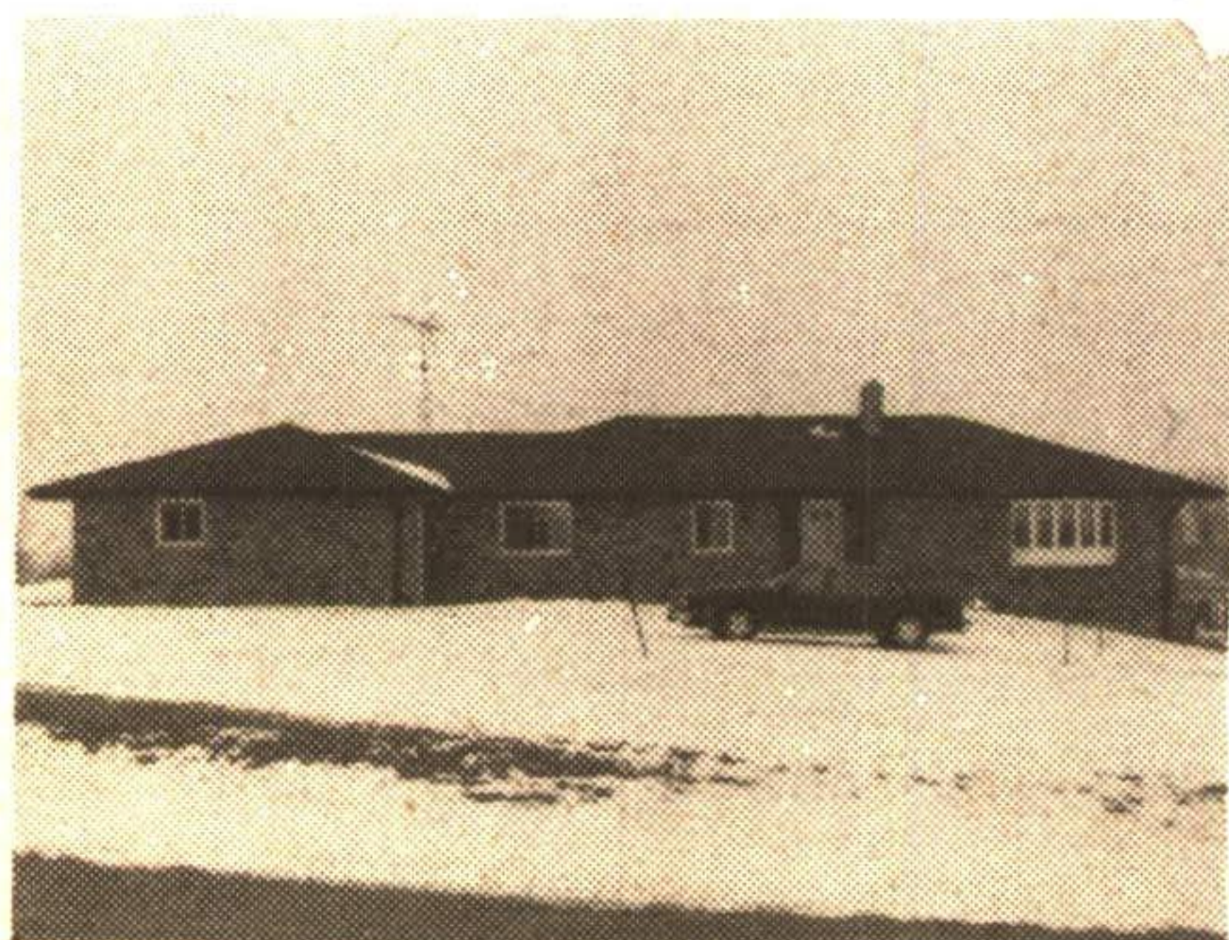
ALMOST NEW CUSTOM BUNGALOW $369,900!!

This spacious home is approximately 2,400 square feet of living space and includes stone fireplace in family room with walkout to deck, sunken living room with brick fireplace, 3 bathrooms, lovely hardwood floors in living and dining rooms, cosy eat-in kitchen, above ground pool on nicely landscaped property and much more. RM9181