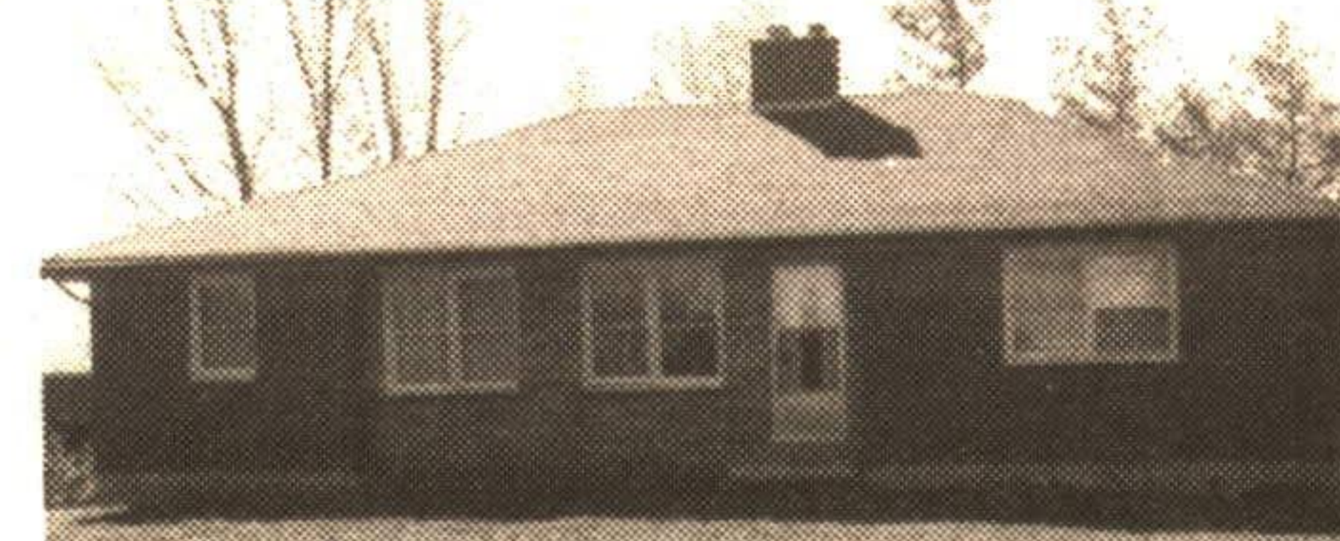
COUNTRY BUNGALOW $285,000

Spacious brick and stone rancher on lovely treed property located just minutes from Georgetown, with excellent access to Hwy. 401. Features include main floor family room with fireplace, built in stove and oven, 3 bedrooms, double car garage, 2 walkouts to lovely deck and more. Call for details. RM9240