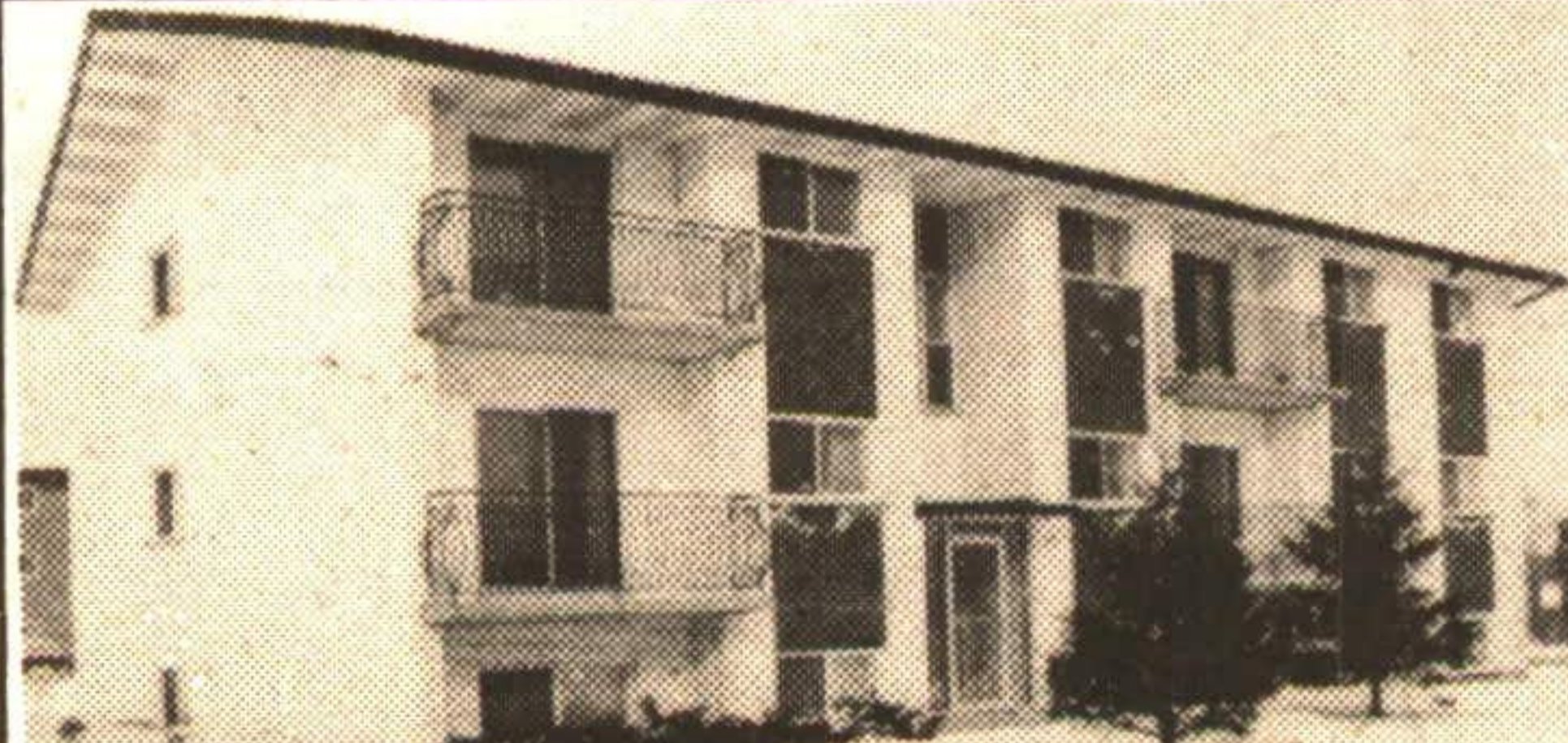
INVEST IN INCOME PRODUCING REAL ESTATE!

Stunning new 5 bedroom home comprised of 4000 sq. ft. of luxury space. Some of the many fine features include 3 skylights, plaster mouldings, gorgeous oak panelled family room with stone fireplace, French doors, lovely oak kitchen, 50 oz. broadloom throughout, ceramic floors in entry & all baths and much much more. RM9305