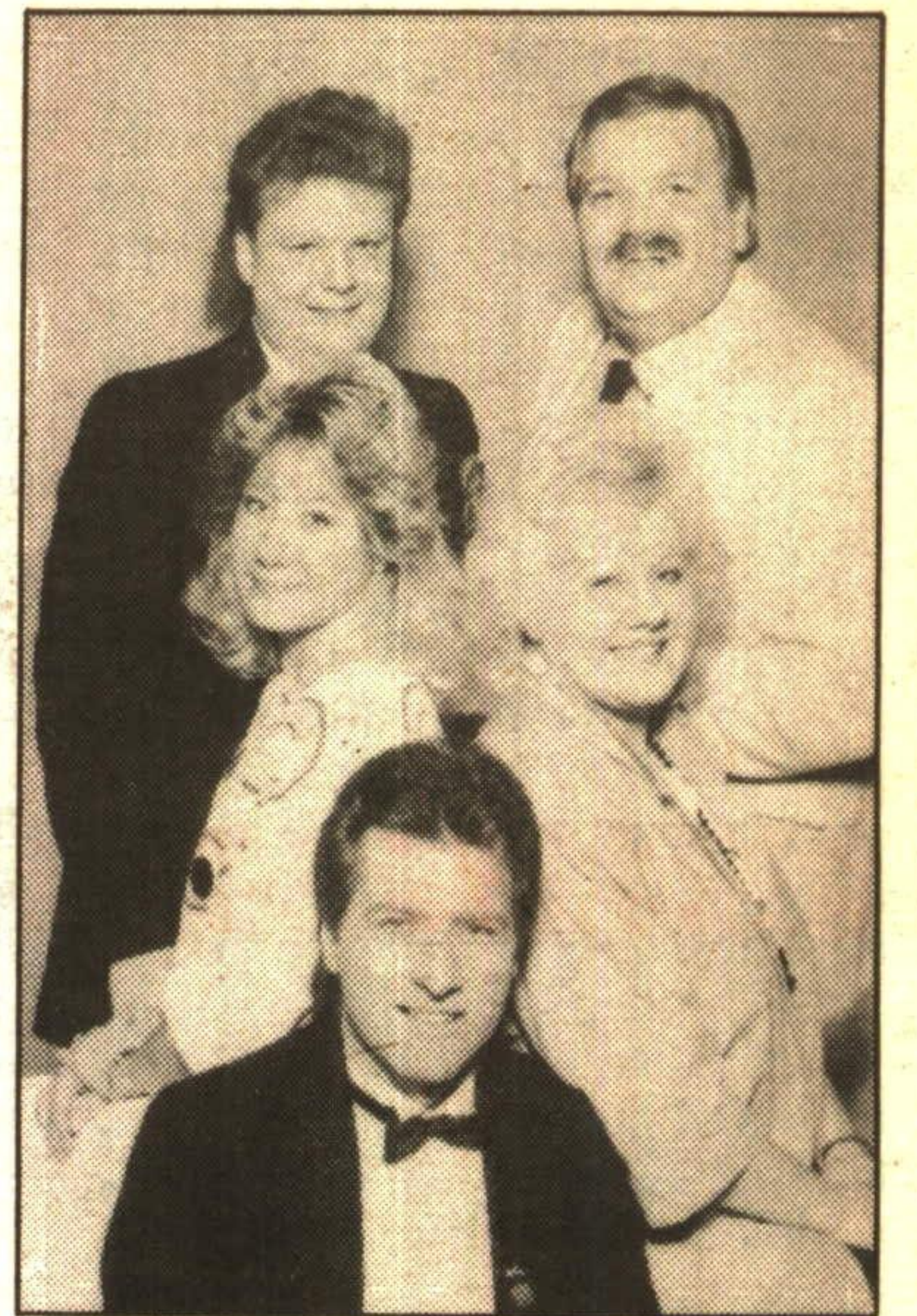
Promise, a country/gospel music group will be at the Evangel Pentecostal Tabernacle, 33 Churchill Rd., Acton tomorrow (Sunday) at 7 p.m. Promise ranks among the top Christian music groups in the country. There is no admission charge and everyone is welcome. For more information the number of the church is 853-2715.

Jesus is our Peace Bridge to get into the kingdom.