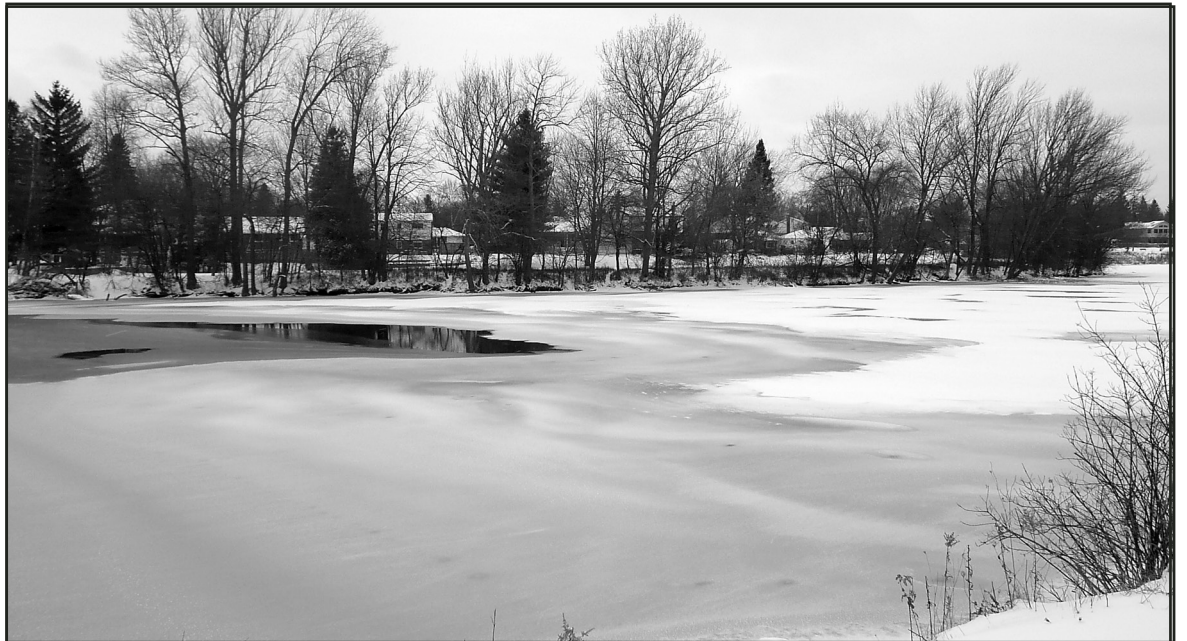
CREEPING COLD: Inch by inch, the sheet ice is taking over more and more of Fairy Lake.

• From December 1 to December 31, Halton Regional Police stopped 35,877 vehicles in R.I.D.E. checks throughout Halton. One hundred and ninety roadside breath tests were conducted, 28 drivers received 12-hour licence suspensions. Three people were charged with Impaired Driving offences (two in Burlington, one in Oakville).