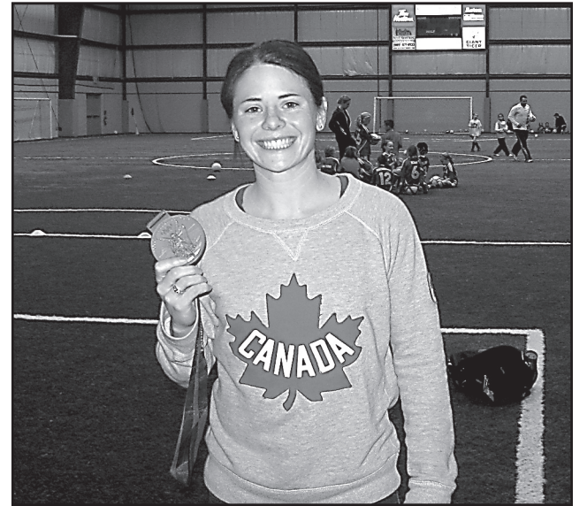
BRONZE GOLD: Olympian Diana Matheson — who scored the winning goal in the Bronze medal game at the London Olympics for the Canadian Women's soccer team — signed autographs and practiced with a local girl's soccer team recently at Acton's Dufferin Centre.