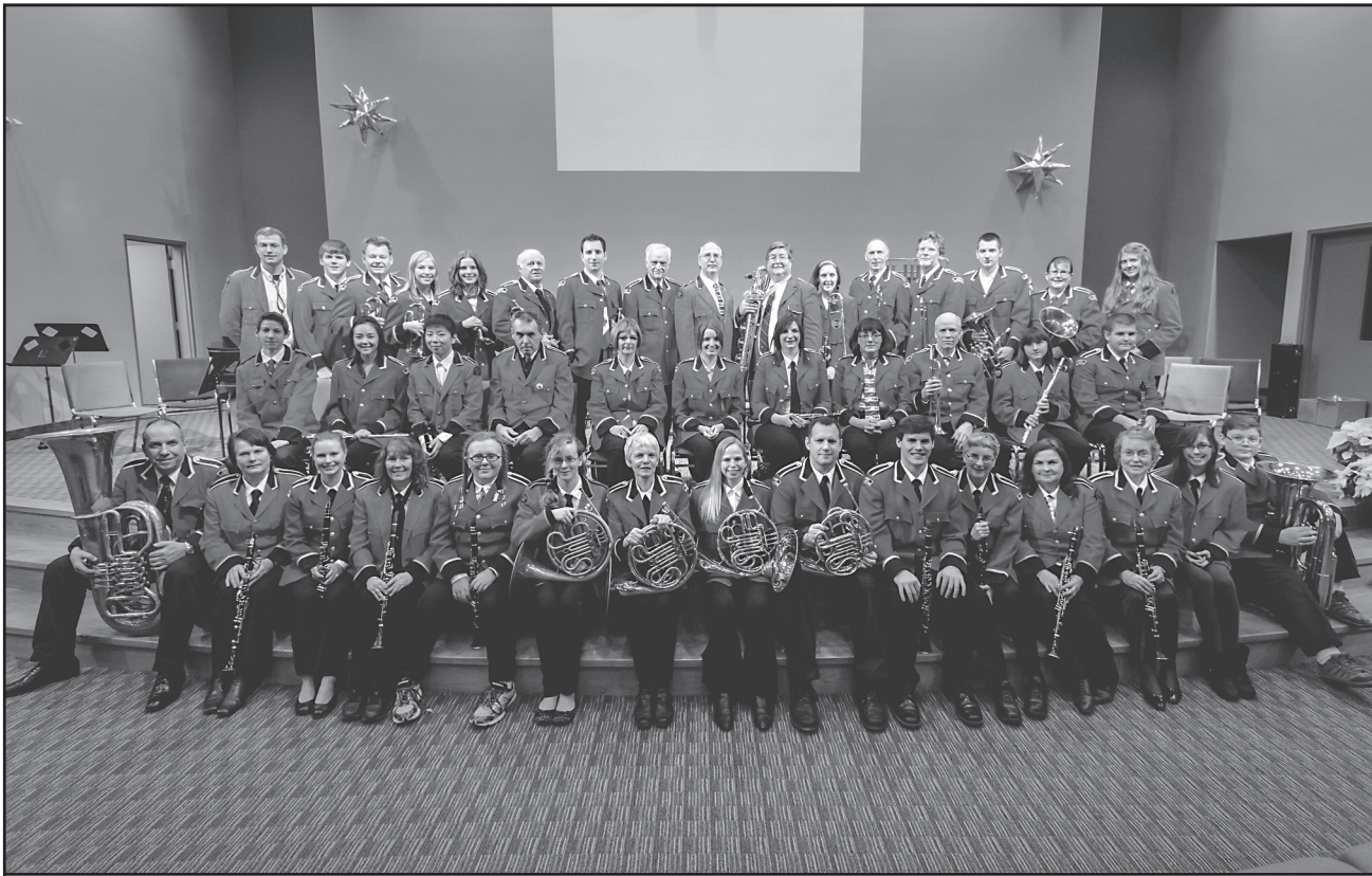
HOLIDAY SONGS: Members of the Acton Citizens Band posed for a group shot after entertaining a large appreciative crowd with holiday favourites at its annual Christmas concert on Sunday at Bethel Christian Reformed Church.

Comrades, It is hard to believe that December is here and the weather is still not too bad. We are getting lots of rain but no snow. I think the rain is way better than the snow. But people say that they need snow to get in the mood for Christmas. Now, if we could get snow just on Christmas Day. That would be so good.