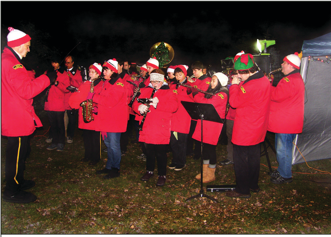
CHRISTMAS CAROLS: Members of the Acton Citizens Band entertained a large crowd with Christmas music at the Light Up The Hills ignition ceremony on Saturday at the Town Christmas tree in Acton East.