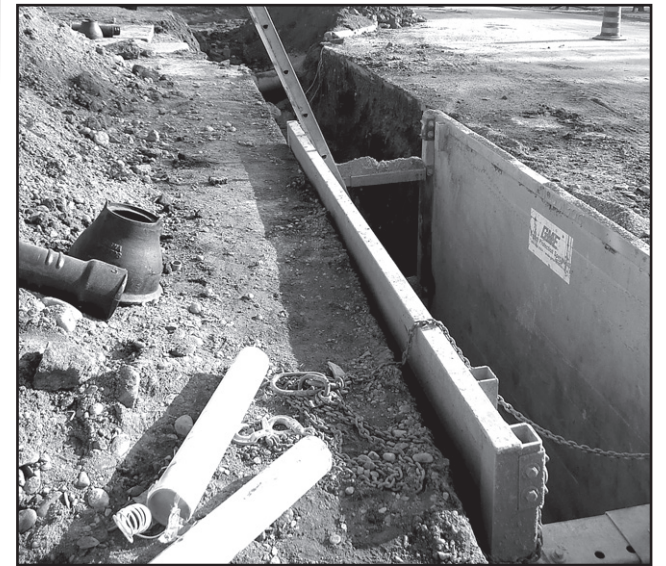
PIPE PROGRESS: Halton’s project to replace aging water and wastewater pipes under Main Street North is on budget and on schedule for completion by December 21