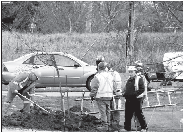
GAS LEAK INVESTIGATION: A contractor replacing water and sewer pipes under Main Street North said its excavator hit an underground natural gas pipe which was not on a “locates” map supplied by Union Gas, which said it is still investigating the incident.

As to blame, “we have not determined the cause,” Stass said.