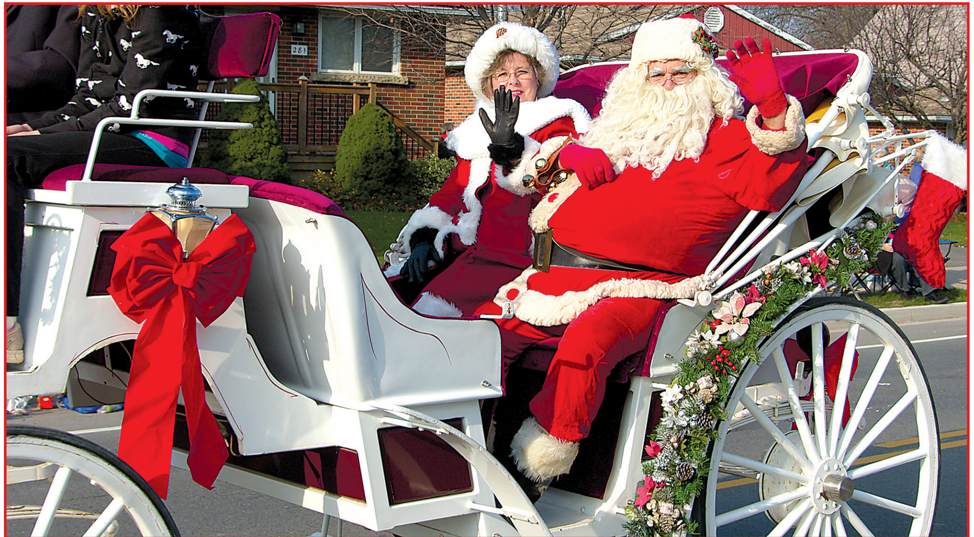
ACTON WELCOMES SANTA: Santa and Mrs. Claus were all smiles and waves as they greeted the large crowds that lined the annual Acton Santa Claus parade route on Saturday.