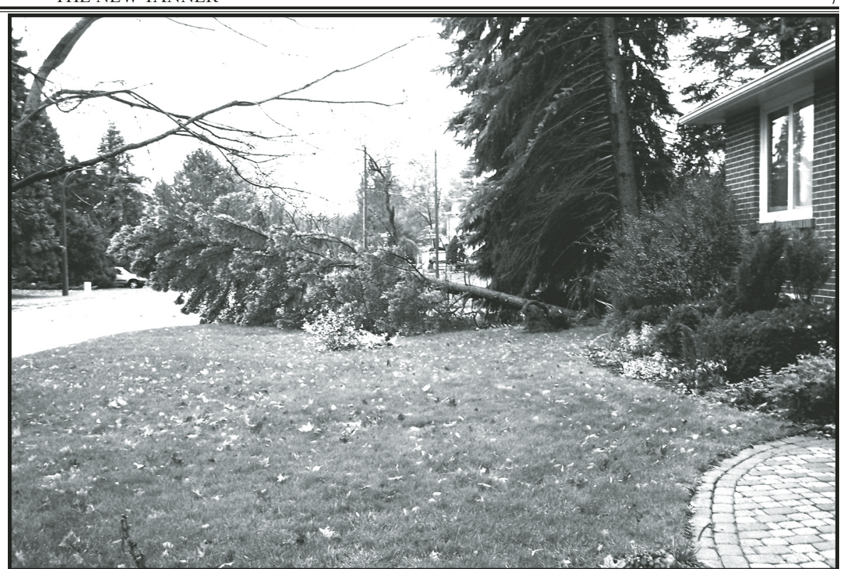
STORM DAMAGE: For the second time in recent years, owners of the property at Tidey Avenue and Elizabeth Drive lost a tree during high winds. This pine tree was downed early Tuesday morning.

Patrolling Enforcement Officers can issue tickets or have offending vehicles towed. Because improper snow and ice clearing can be hazardous to vehicles and pedestrians, the Town asks people not to push shovelled snow across roads as it makes rod icy.