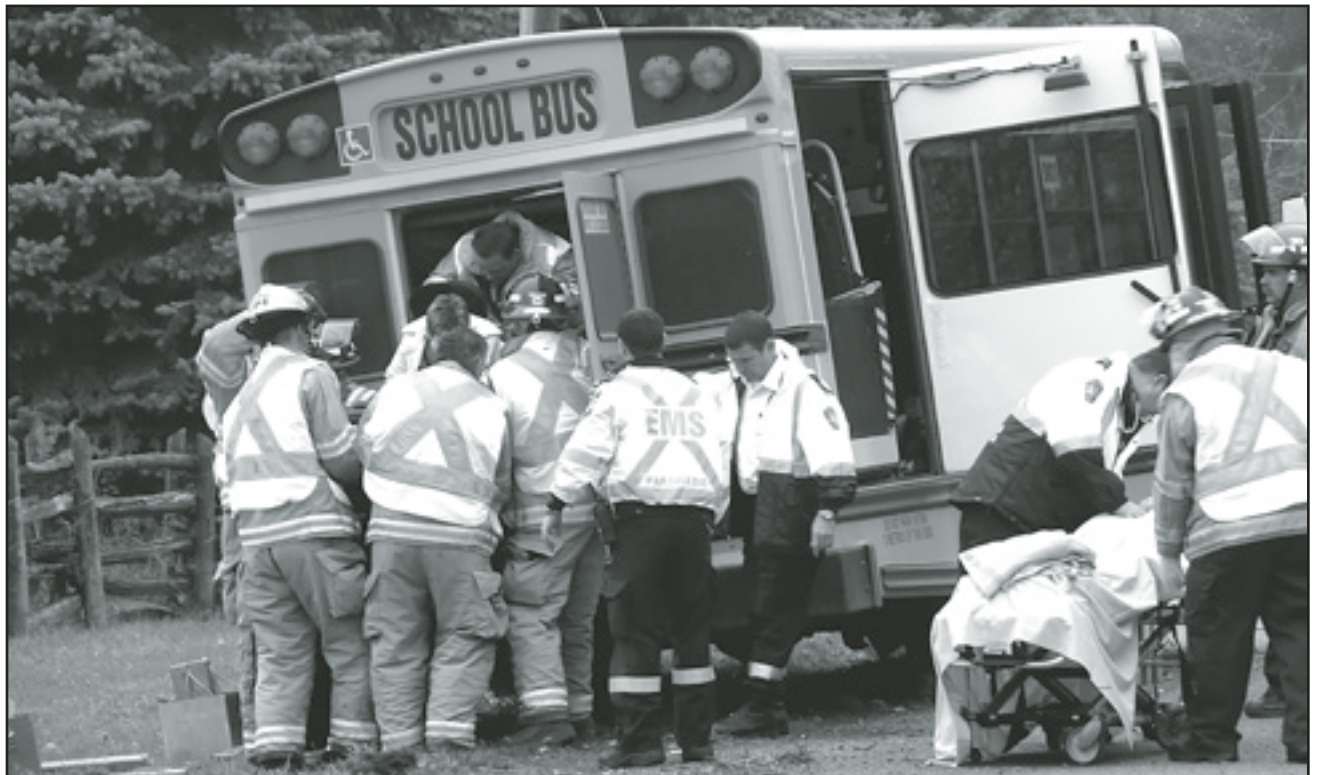
'MEDICAL DISTRESS': Emergency crews removed a disabled girl from a Tyler Transport school bus that drifted off the road on the Sixth Line, north of Highway 7, last Wednesday afternoon after the middle-aged female driver was in what police called "medical distress." The driver remains in hospital. The passenger was not injured but was taken to hospital for observation.

The Committee of Adjustment meeting on the minor variance application is Monday, November 7 at 7 p.m., at the Civic Centre.