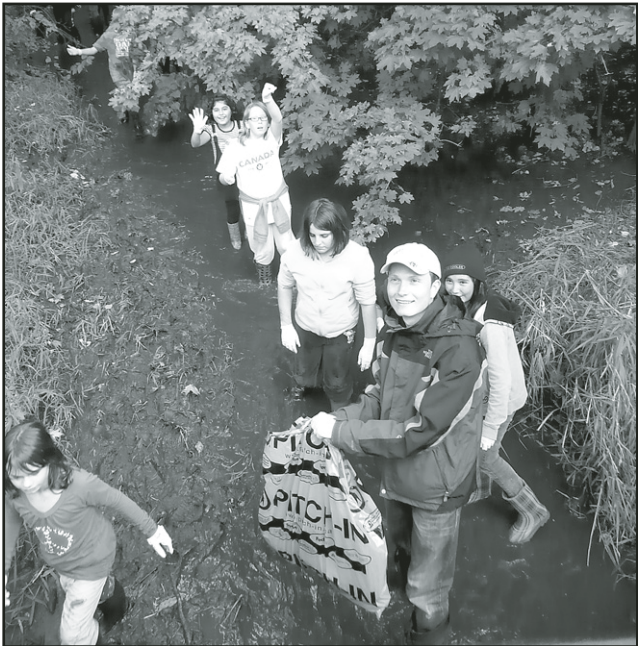
CREEK CLEANUP: Approximately 135 Junior students from Robert Little School staged their annual clean-up of Black Creek on Friday, doing their part for the environment and the community.