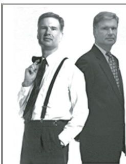
Where friends gather...

Casual to Formal Conventional or Unconventional Blue Springs is a comfortable atmosphere where friends can gather.