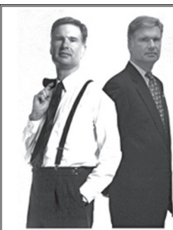
Where friends gather...

Casual to Formal Conventional or Unconventional Blue Springs is a comfortable atmosphere where friends can gather.