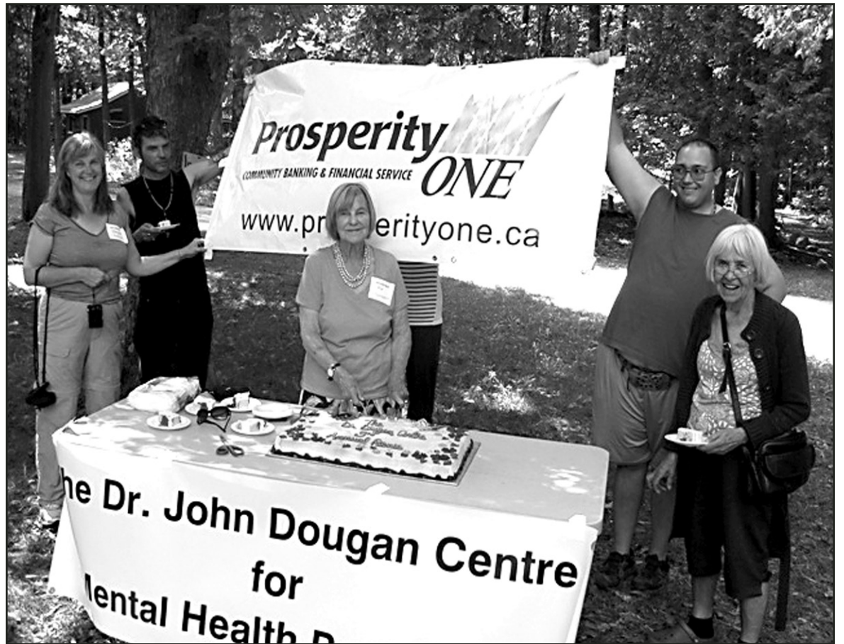
PICNIC PALS: Guests enjoyed a recent picnic at Camp Edgewood in Eden Mills to celebrate the work of Acton's Dr. John Dougan Centre for Mental Health Promotion.