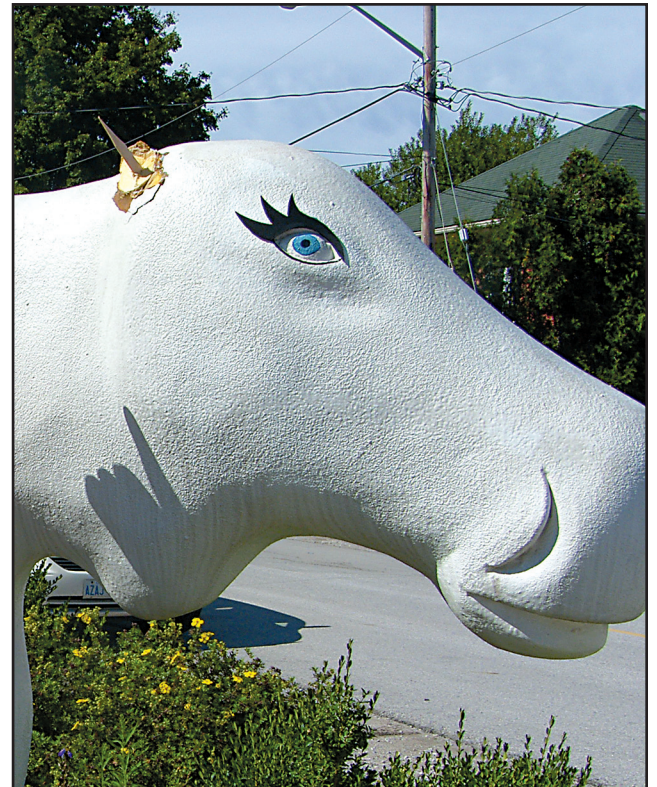
WIND DAMAGE: The first time Sweet Molly's mascot moose lost its ear was due to vandalism – this time the wind blew it off.