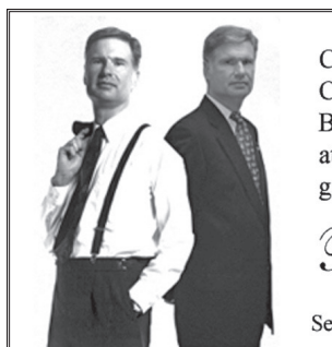
Where friends gather...

12 Church Street East, Acton 519-853-2399