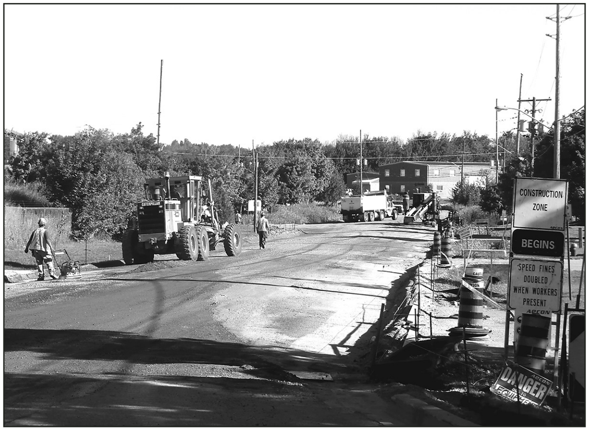
CURB APPEAL: Crews continue to reconstruct Commerce Crescent – including adding curbs – to improve the look of Acton's industrial area.