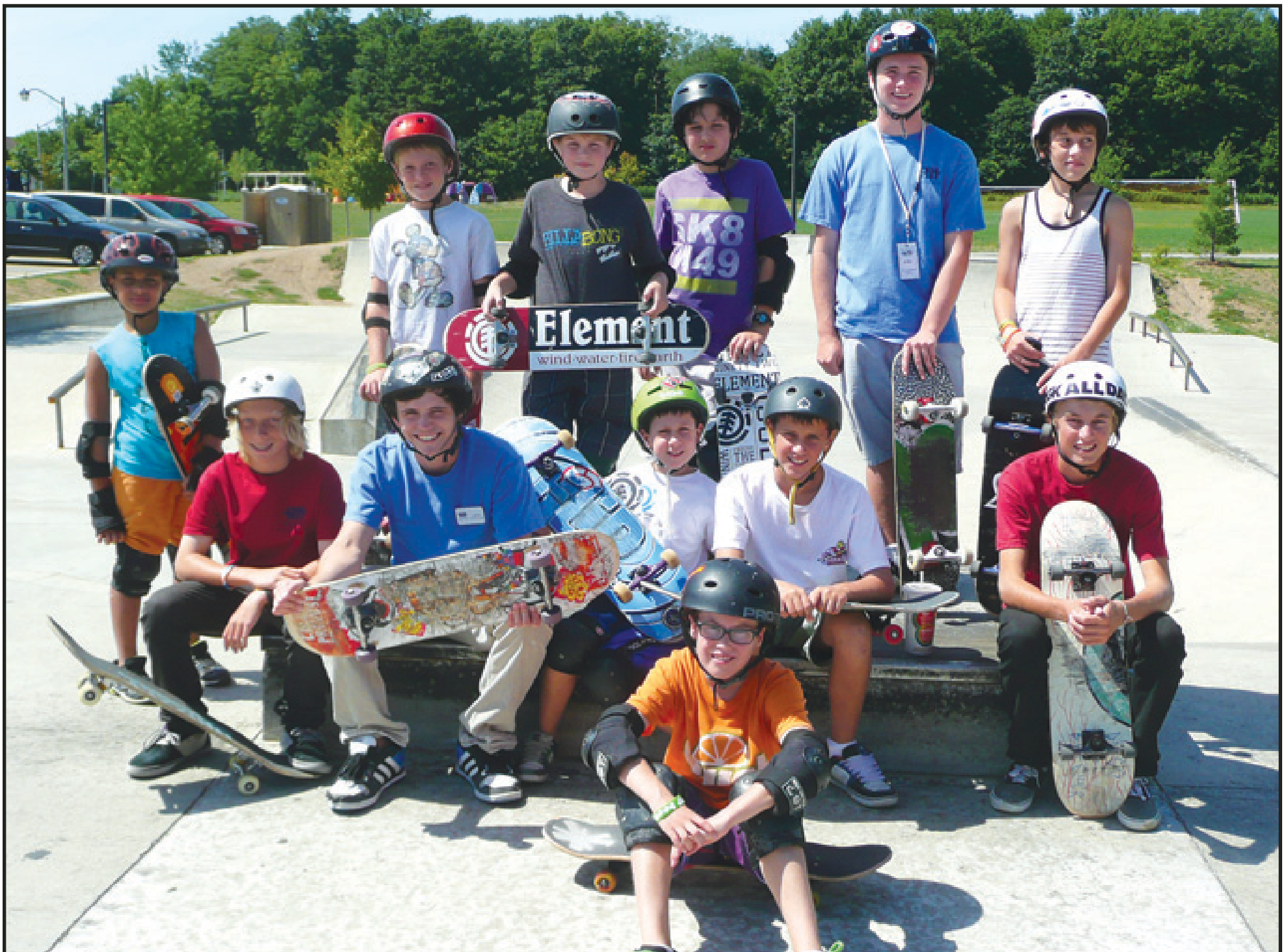
BOARD BOYS: These Acton area boys took part in the Town's Skateboard Mania camp at the Acton skate park this week, honing their moves and learning new skills. It was the only Acton skateboard camp this summer – the first one was cancelled due to low registration numbers.