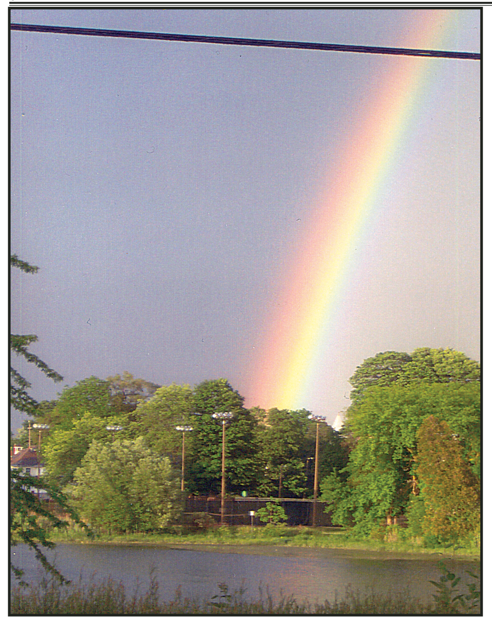
POT OF GOLD: Mother Nature put on quite a display of colour at suppertime on Saturday with this beautiful after-storm rainbow. - Submitted photo