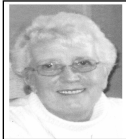
Wife, mother and Grandmother.

There comes a time for all of us When we must say goodbye But memories of those we love Live on and never die.