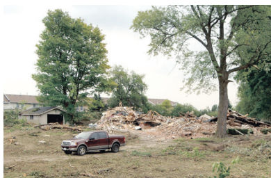
This is what remained of the property at 127 Mountainview Rd. N. Friday.