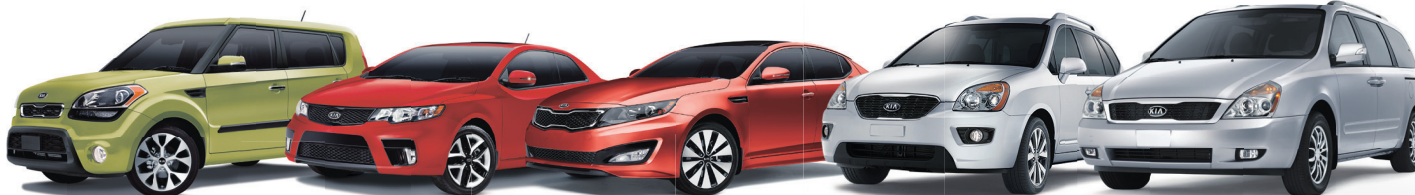
Soul 4u Luxury shown

2012 CLEAROUT UP TO $6,650 IN CASH SAVINGS †