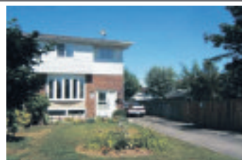
LOCATION! LOCATION! $386,500

www.RichardsonTownandCountry.ca 12-349 W2435211