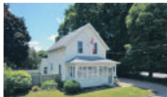
16 George Street, Georgetown Sunday, August 19th, 2:00-4:00 $484,900