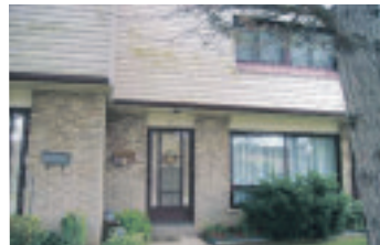
FABULOUS LOCATION! $239,500

www.haltonhomesearch.com 12-343 W2423884