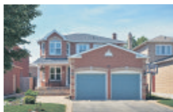
4 BEDROOM ACROSS FROM PARK $559,000