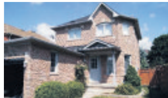
14271 Argyll Road, Georgetown Sunday, August 19th, 2:00-4:00 $467,500