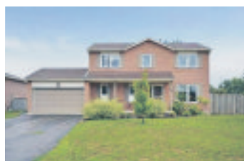
SPACIOUS & BRIGHT 4 BEDROOM HOME $459,900

Plan your weekend – when and where to attend the most desirable open houses: www.johnsonassociates.ca