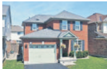
VERY DESIRABLE NEIGHBOURHOOD $399,900

www.realestatethatmovesyou.ca 12-348 W2434694