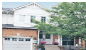
41 Harding Street, Georgetown Sunday, August 19th, 2:00-4:00 $330,000