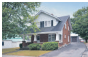
THREE BEDROOM, LARGE HEATED SHOP $439,000