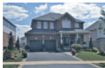
BEAUTIFUL CHARLESTON HOME $574,500