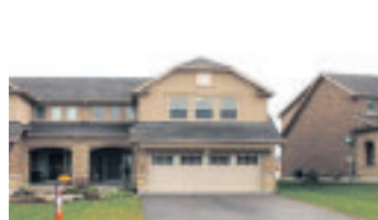
109 Millview Court, Rockwood Saturday, August 18th, 2:00-4:00 $469,900