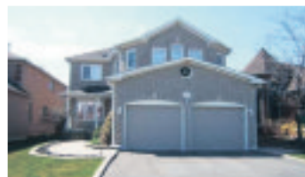
32 Harrop Avenue, Georgetown Saturday, August 18th, 2:00-4:00 $544,900