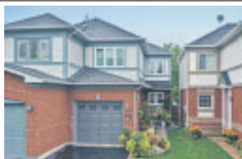
AFFORDABLE UPDATED SEMI $369,900