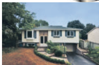
VIRTUAL TOUR AT www.willsell.ca $349,900