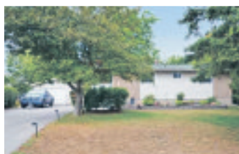
SIMPLY MOVE IN $349,000