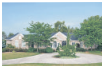
TOTAL PRIVACY! $799,900