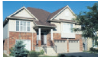
174 Tanners Drive, Acton Sunday, August 19th, 2:00-4:00 $525,000