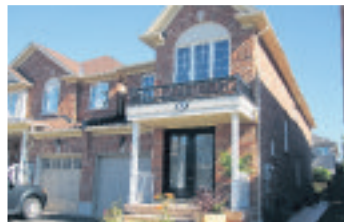
4 BDRM LINK-UPGRADED & OVER IMPROVED $424,900

www.haltonhillshomesforsale.com 12-347 W2434732