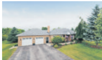
3 Southwinds Drive, Halton Hills Sunday, August 19th, 2:00-4:00 $739,900