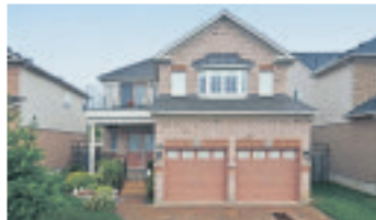
77 Division Street, Acton Sunday, August 19th, 2:00-4:00 $499,000

Full listing details available at: www.johnsonassociates.ca