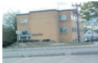
PROFESSIONAL OFFICE SPACE $950/Month

www.haltonhomesearch.com 12-343 W2423884