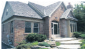
19605 Main Street, Alton Sunday, August 19th, 2:00-4:00 $674,900