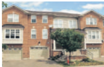
GREAT STARTER FREEHOLD TOWNHOME $349,900