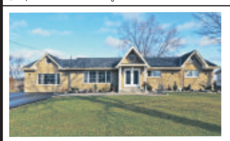
It's Bigger Than It Looks! Spacious iron-gated, custom-built Country Estate Bungalow boasts 4,200 sq ft of living space with 3 + 2 bdrms, 3 baths, Jatoba maple hardwood floors, crown molding & 6" baseboards. Beautifully finished lower level with laminate floors, TV Room, Rec Room & 2 large bdrms. Master with luxurious 6 piece marble ensuite. $1,275,000.00 Georgetown MLS#W2344404

Turn the Key and come home to this charming 2 + bdrm, 1 bath bungalow in the heart of Georgetown. Located close to schools, parks & Historic Downtown with shops, restaurants, library & seasonal Farmer's Market. Bright main level with Living Room, separate Dining Room, Kitchen, 2 generous bdrms & 4 piece bath. Finished basement. $324.900.00 Georgetown MLS#W2420376