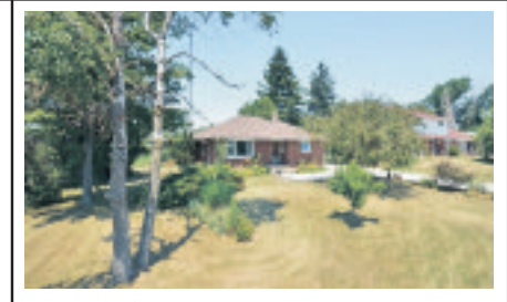
Settle for More! A charming 2 bdrm, 1 bath bungalow located on a 1/3 acre lot just a few minutes to Georgetown, Mississauga & major highways - perfect for commuters! With good-sized rooms & gleaming hardwood throughout, this home offers the perfect blank palette for your ideas. Endless possibilities in the partially finished basement. $389,900.00 Halton Hills MLS#W2412578

1-877-893-9001 • YourHomeToday Berly Inc.