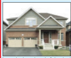
SHOW STOPPER - 2 YEARS NEW EXECUTIVE HOME FOR THOSE WITH GREAT TASTE $689,900

JUST SOLD Get the Most Experience Working For You.