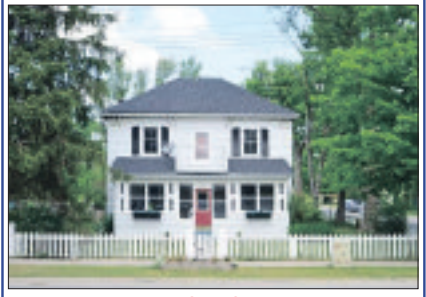
RETURN TO A QUIETER & GENTLER PLACE! $459,900