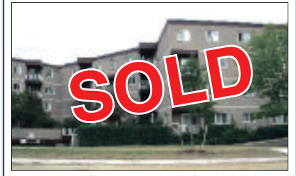
ATTRACTIVE AND AFFORDABLE 2-STOREY CONDO SITUATED IN THE PRESTIGIOUS VILLAGE OF CLARKSON $179,988