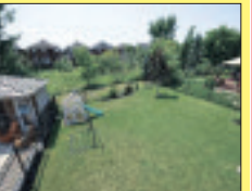
STUNNING HOME BACKING ONTO MATURE GREENBELT $669,900

On a desirable street in G'town South, this gorgeous home is extensively upgraded & beautifully decorated in modern colours. Includes granite in massive gourmet kitchen & baths, hardwood in liv/dining/family rms, 3 gas fireplaces, organizer shelving in all closets, quality lighting throughout, attractive elevation with triple front doors with transom above & much more. Bright walkout basement is fully finished for extra living space. Inground sprinkler system, flagstone front porch, concrete walkways & fully fenced. Immaculate move-in ready!