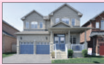
120 FITZGERALD CRESCENT $559,900

Amazing Courtyard Design that'll blow your socks off...siding onto large evergreen trees & a brand new bungalow on the other side! Brand New...Over 2200 sq ft of quality finishes on 1/2 an acre. Town water, gas & cable...doesn't even feel like country yet you have the space. Fabulous open concept bungalow floor plan w/granite counters, solid raised panel maple kitchen cabinetry, 9 ft ceilings, gas fireplace, hrdwd, berber, all brick, vinyl casement windows, triple car garage! Move in Aug/Sept!