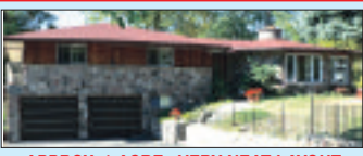
APPROX. 1 ACRE - VERY NEAT LAYOUT WITH GREAT ACCESS TO TOWN! $559,900

On a desirable street in G'town South, this gorgeous home is extensively upgraded & beautifully decorated in modern colours. Includes granite in massive gourmet kitchen & baths, hardwood in liv/dining/family rms, 3 gas fireplaces, organizer shelving in all closets, quality lighting throughout, attractive elevation with triple front doors with transom above & much more. Bright walkout basement is fully finished for extra living space. Inground sprinkler system, flagstone front porch, concrete walkways & fully fenced. Immaculate move-in ready!