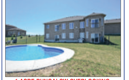
1 ACRE BUNGALOW OVERLOOKING A BEAUTIFUL LAKE. 10 MINUTES FROM GEORGETOWN $899,900