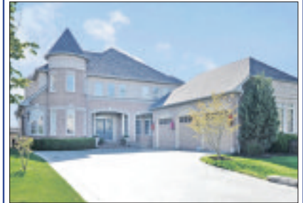
DREAM ON! 3730 AUGUSTA MODEL! $1,150,000