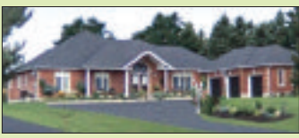
LUXURY FINISHES, COUNTRY LIVING, BUT WALK TO DOWNTOWN ERIN $659,900

RE/MAX Platinum Award Honours Bachelor Of Business, Graduate Degree in Journalism