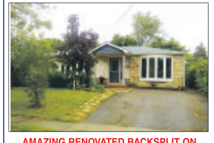
AMAZING RENOVATED BACKSPLIT ON VERY DESIRABLE STREET IN GEORGETOWN. $457,900