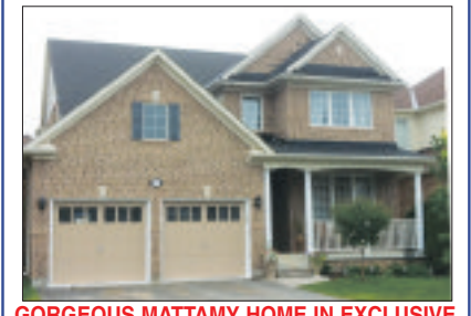
GORGEOUS MATTAMY HOME IN EXCLUSIVE ENCLAVE OF ARBORGLLEN SURROUNDED BY RAVINES AND WOODS $579,900