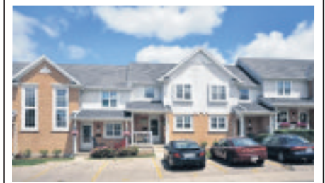
Why Pay Rent? When you can own this 2 bedroom, 1.5 bath condo townhouse located in Guelph's popular & growing East End Community! Main level features eat-in Kitchen and Living Room with hardwood, gas fireplace & W/O to backyard. 2 generous bedrooms hardwood & large closets. Finished basement with Rec Room and 2 piece bath. $209,900.00 Guelph MLS#X2405354

Morning Coffee on the patio overlooking the gardens of this exceptional 4 bdrm, 2 bath home - located on a mature, landscaped ½ acre lot just minutes to Georgetown & major highways. The layout of the main level was designed for gracious entertaining - featuring Living Room with gleaming hardwood & bay windows, separate Dining Room, and completely renovated Kitchen with granite counters, stainless steel appliances, breakfast bar & pantry. On the 2nd level 4 bdrms share a renovated bath with Jacuzzi tub. Finished lower level offers a spacious Rec Room & laundry room with great storage & W/O to patio. This lovely 100' x 214' lot features amazing stone work, gardens & landscaping - your own private oasis! $624,900.00 Norval MLS#W2373251