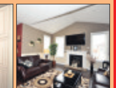
SHOW STOPPER - 2 YEARS NEW EXECUTIVE HOME FOR THOSE WITH GREAT TASTE $689,900

Impressive beyond words & luxuriously appointed with quality upgrades including hand scraped hrwd thruout entire house! Soaring cathedral/coffered ceilings, upgraded baseboards, wainscoting, mouldings, trim at every turn. Gorgeous gourmet kit. with granite & split stone counter accent. Modern open concept layout with a great rm having cathedral ceiling & a gas fireplace. Separate formal living rm for those special gatherings. Upgraded stairs lead to a magnificent marble ensuite fit for royalty & a massive walk-in closet. Convenient 2nd flr laundry is a bonus. Call us to view.