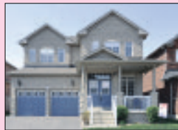
GREEN PARK HOME FINISHED TOP TO BOTTOM WITH FABULOUS DECK $559,900

Amazing Courtyard Design that'll blow your socks off...siding onto large evergreen trees & a brand new bungalow on the other side! Brand New...Over 2200 sq ft of quality finishes on 1/2 acre. TOWN water, gas & cable...doesn't even feel like country yet you have the space. Fabulous open concept bungalow floor plan w/granite counters, solid raised panel maple kitchen cabinetry, 9 ft ceilings, gas fireplace, hrwd, berber, all brick, vinyl casement windows, triple car garage! Move in Aug/Sept!