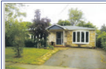
AMAZING RENOVATED BACKSPLIT ON VERY DESIRABLE STREET IN GEORGETOWN. $457,900