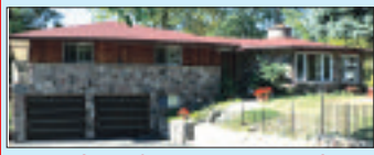
APPROX. 1 ACRE - VERY NEAT LAYOUT WITH GREAT ACCESS TO TOWN! $559,900

Was the former model home and be prepared to be impressed!!! Over 3,000 sq feet of luxury living space featuring soaring 10.5 ft ceilings on main floor, lots of quality upgrades including maple hardwood floors, gourmet kitchen with stunning glass backsplash, upgraded lighting, California shutters, closet organizers & much more. Unique, one-of-a-kind floor plan, perfect for Nanny/inlaws/teenagers, with two separate staircases to second floor. Beautiful landscaping with spectacular curb appeal. Great family area, close to downtown and all amenities.