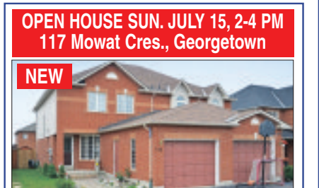
OPEN HOUSE SUN. JULY 15, 2-4 PM 117 Mowat Cres., Georgetown