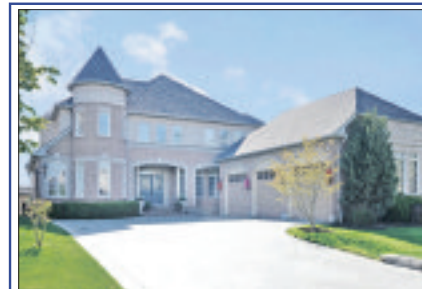
DREAM ON! 3730 AUGUSTA MODEL! $1,150,000