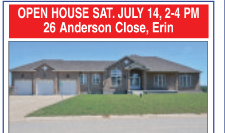
OPEN HOUSE SAT. JULY 14, 2-4 PM 26 Anderson Close, Erin