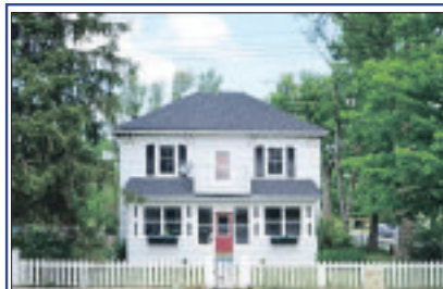
RETURN TO A QUIETER & GENTLER PLACE! $459,900