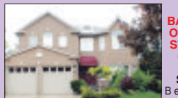
RAVINE BACKDROP ON AN "IT" STREET IN G'TOWN SOUTH $799,900

Sprawling, 4 bdrm California style bungalow features a unique layout with massive principal rooms having soaring cathedral ceilings, 2 floor to ceiling fireplaces, lovely newer kitchen, gleaming hardwood floors, all replaced windows, roof (2005), 200 amp service, high speed internet & freshly painted thruout. Convenient main floor laundry and brand new powder room. Gorgeous mature landscaping, tandem 4 car garage and a long driveway that holds a dozen cars. Excellent location.