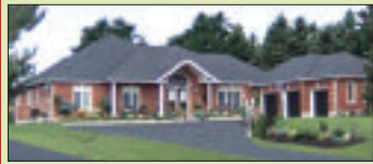
LUXURY FINISHES, COUNTRY LIVING, BUT WALK TO DOWNTOWN ERIN $659,900

The Hrkac family supports the Children's Miracle Network