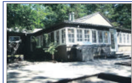
THE GREAT ESCAPE IS RIGHT HERE IN THIS STUNNING YEAR-ROUND COTTAGE IN WASAGA! $457,000