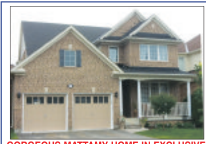
GORGEOUS MATTAMY HOME IN EXCLUSIVE ENCLAVE OF ARBORGLLEN SURROUNDED BY RAVINES AND WOODS $595,900