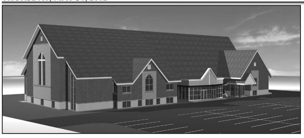
Conceptual drawing - Front view