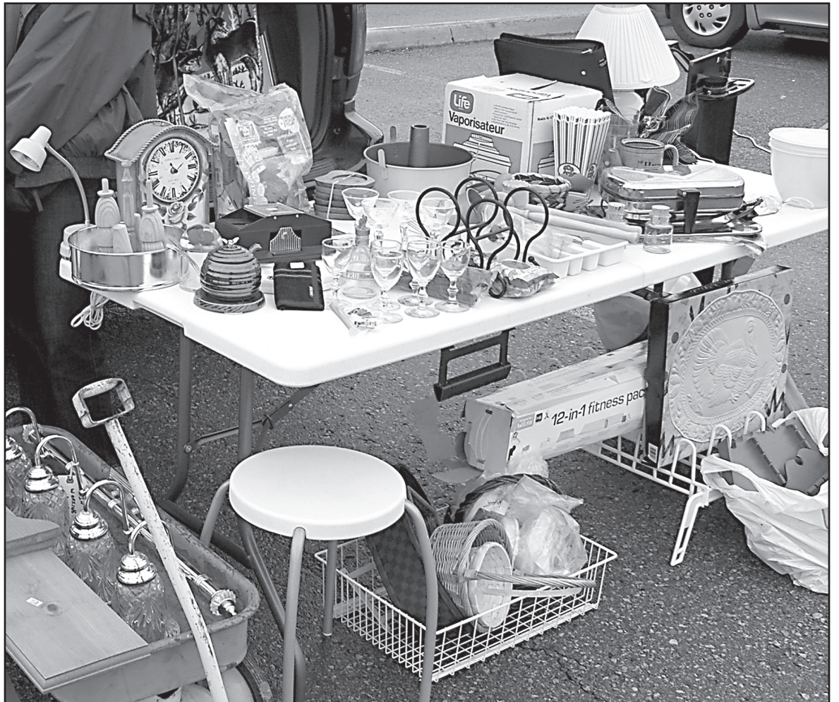
TRUNK LOAD OF TREASURES: The Acton Trunk Sale kicks off its 2012 season this Saturday May 19th at 8 a.m. in the Olde Hide House parking lot. Gates open for vendors at 7:30 a.m.

To help highlight and celebrate the work of Halton Region's paramedics during EMS week, May 20 - 26, our Halton Region Councillors will be receiving paramedics training. The training session will take place at the Woodlands Operation Centre in Oakville on May 22 at 11 a.m. The training for councillors will include ambulance driving, equipment orientation, and a variety of emergency treatments, such as the administration of medication.