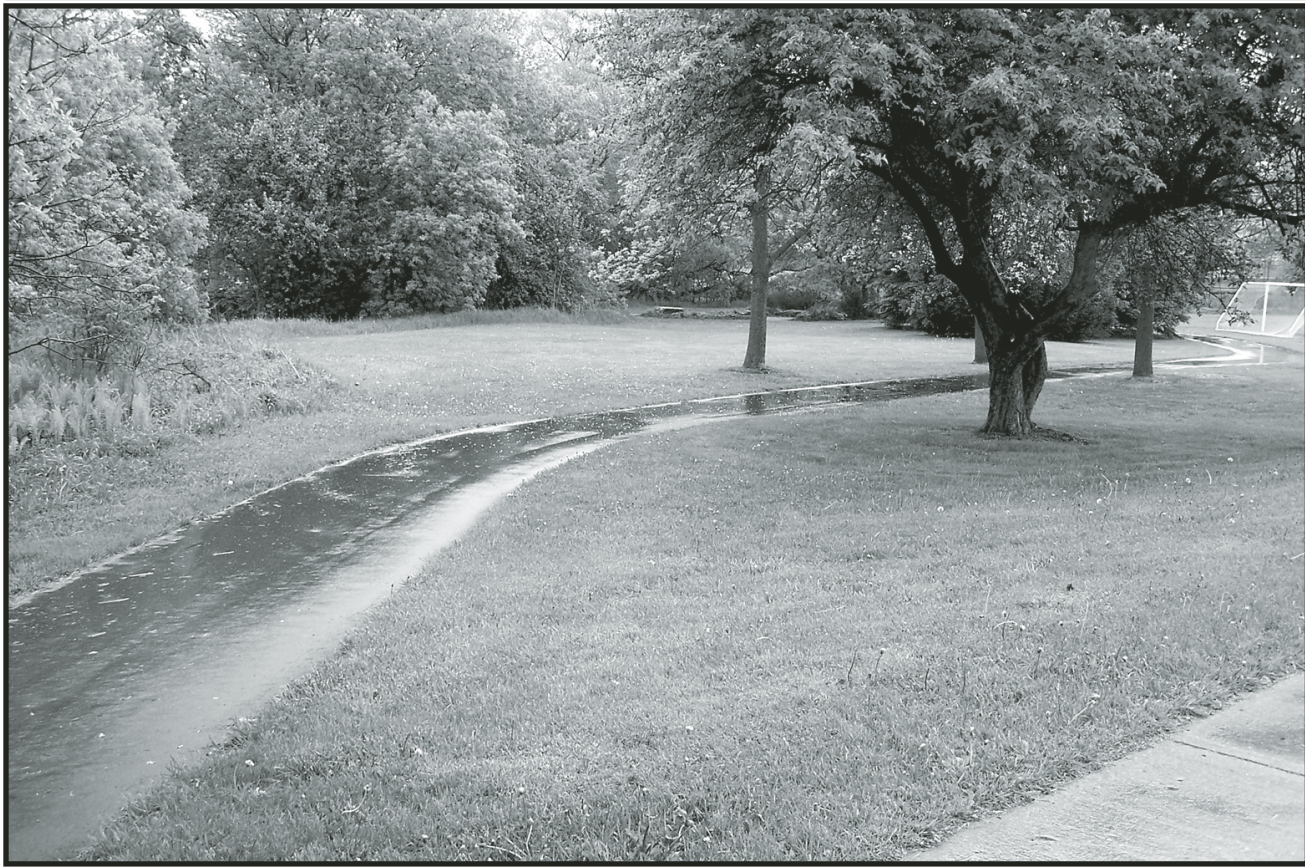
GARDEN DREAMS: Community Development Halton, is optimistic this piece of land will be the location for the new proposed Community Garden, for those who want to learn or share their knowledge of growing.