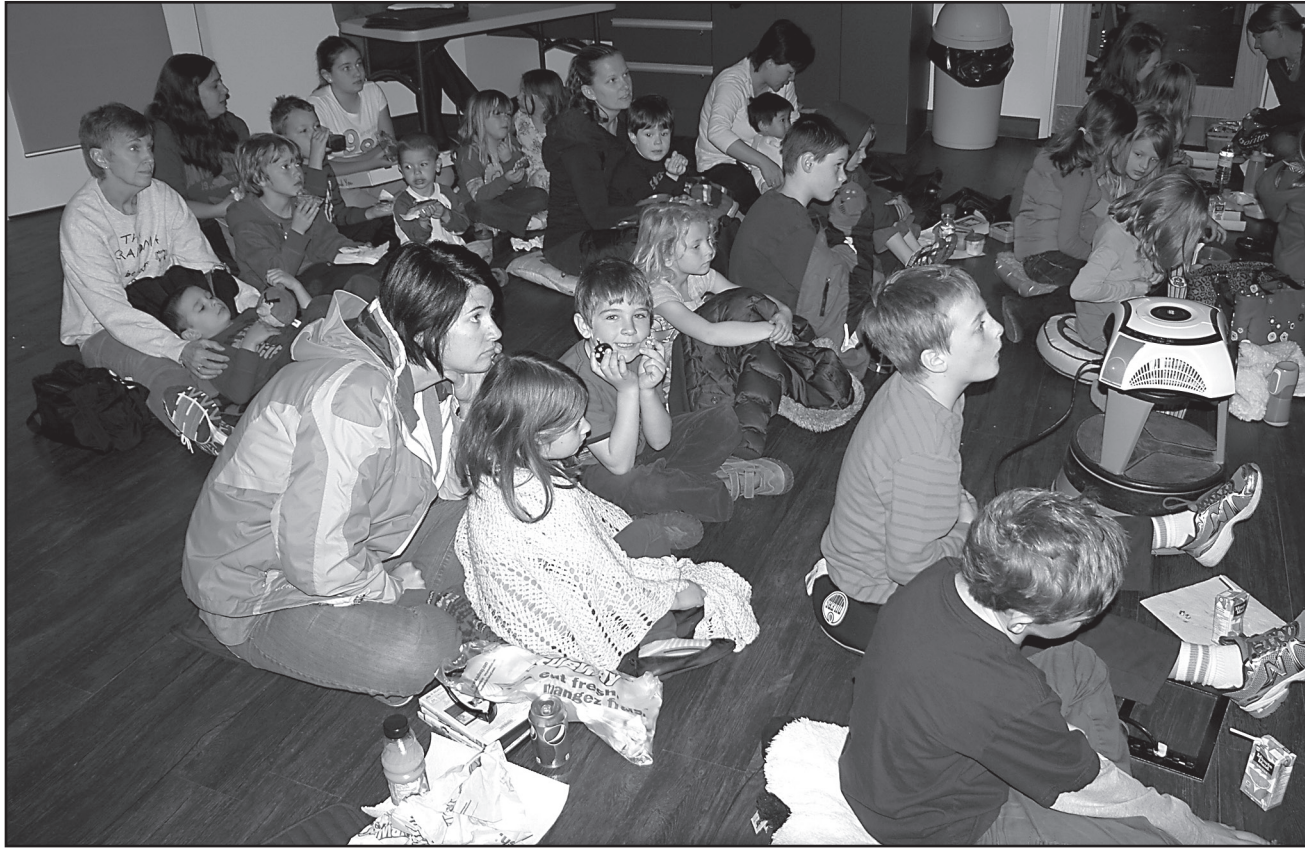
MOVIE & LUNCH: The movie The Muppets drew a huge crowd of kids to the Munch at the Movies event at the Acton library for PA Day fun on Friday.