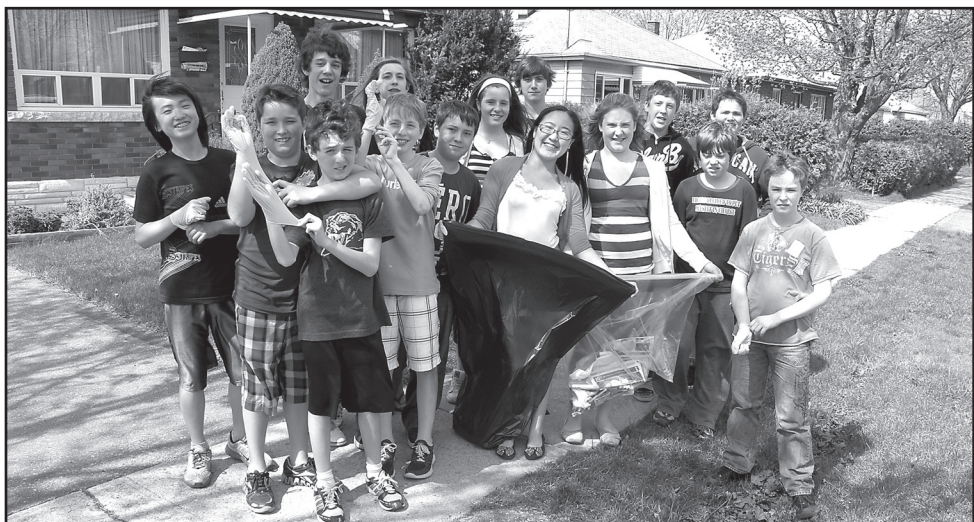
CLEANUP CREW: A crew of students from McKenzie-Smith Bennett School cleaned up litter on Peel Street on Friday as part of the Town's 22-Minute Makeover.