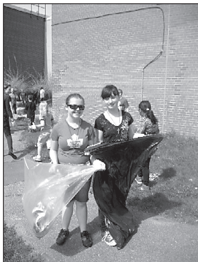
EARTH DAY EFFORTS: Sunny weather made students at McKenzie-Smith Bennett School eager to get out and pick up a winter's worth of waste on Friday as part of the Town's 22-Minute Makeover.