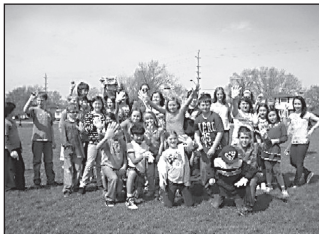
MUSTANG MIGHT: McKenzie-Smith Bennett students cleaned up litter at their school and in the surrounding neighbourhood on Friday as part of the Town's annual cleanup efforts.

In Acton, volunteers – some led by the Mayor and Acton councillors – cleaned up areas of Prospect Park and the downtown.