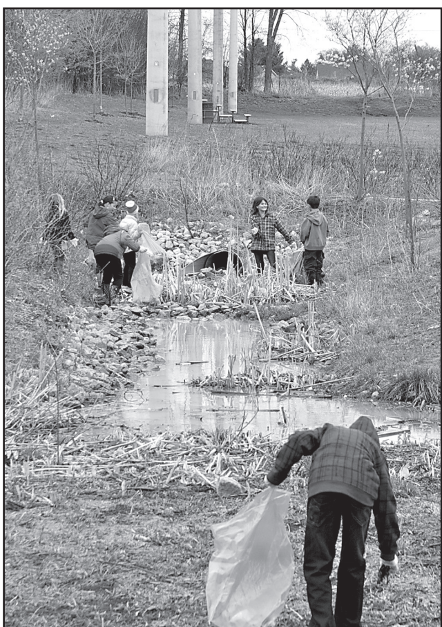
EARTH WEEK WARRIORS: Robert Little School students and area neighbours cleaned up the marsh/wetland area by the Acton arena/community centre on Saturday as part of the Community Cleanup.