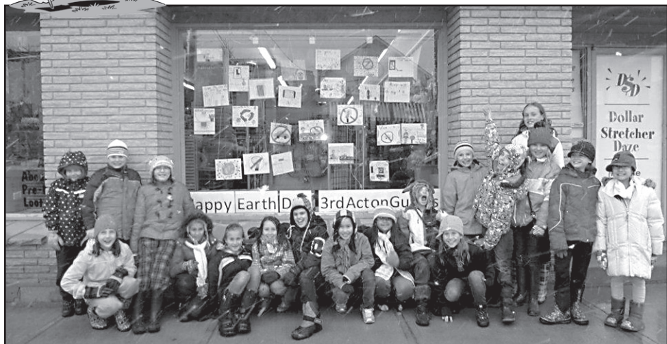
ECO GUIDES: For Earth Day this year members of the 3rd Acton Guides showed how they would conserve energy and save the earth with a poster. Their eco-friendly work is displayed in the window at Dollar Stretcher Daze.