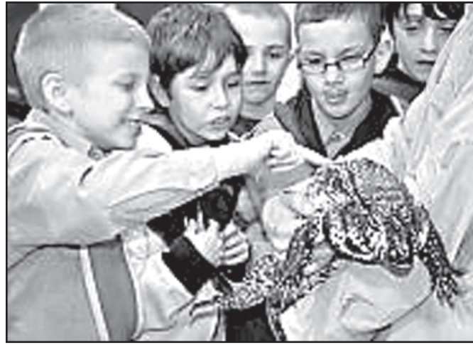
SCOUT/GUIDE WEEK: Rockwood Scouts and Guides recently celebrated the birthday of their Founder, Lord Robert Baden-Powell and his wife, the World Chief Guide, Lady Olave Baden-Powell. The Scouts/Guides checked out several reptiles and critters at Safari Science in Oakville.