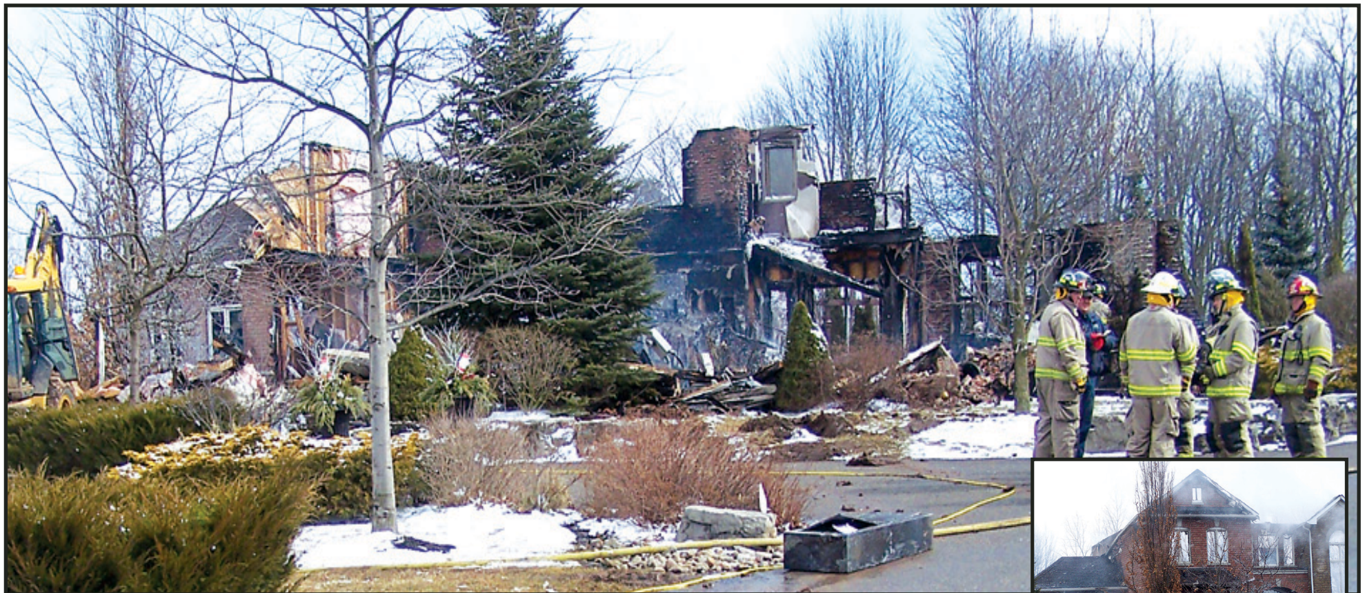
CAUSE UNDETERMINED: The cause of $1.5-million fire that razed a rural home on Forest Ridge Crescent early Friday morning is undetermined, but both the Fire Department and Ontario Fire Marshall found nothing suspicious, and have signed off on the blaze. A family of four escaped without injury, alerted by their smoke alarms.