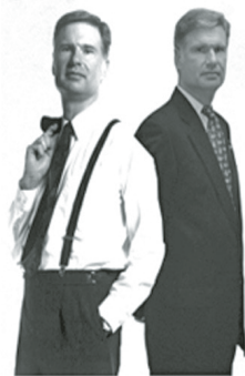
Where friends gather...

or visit www.mackinnonfamilyfuneralhome.com