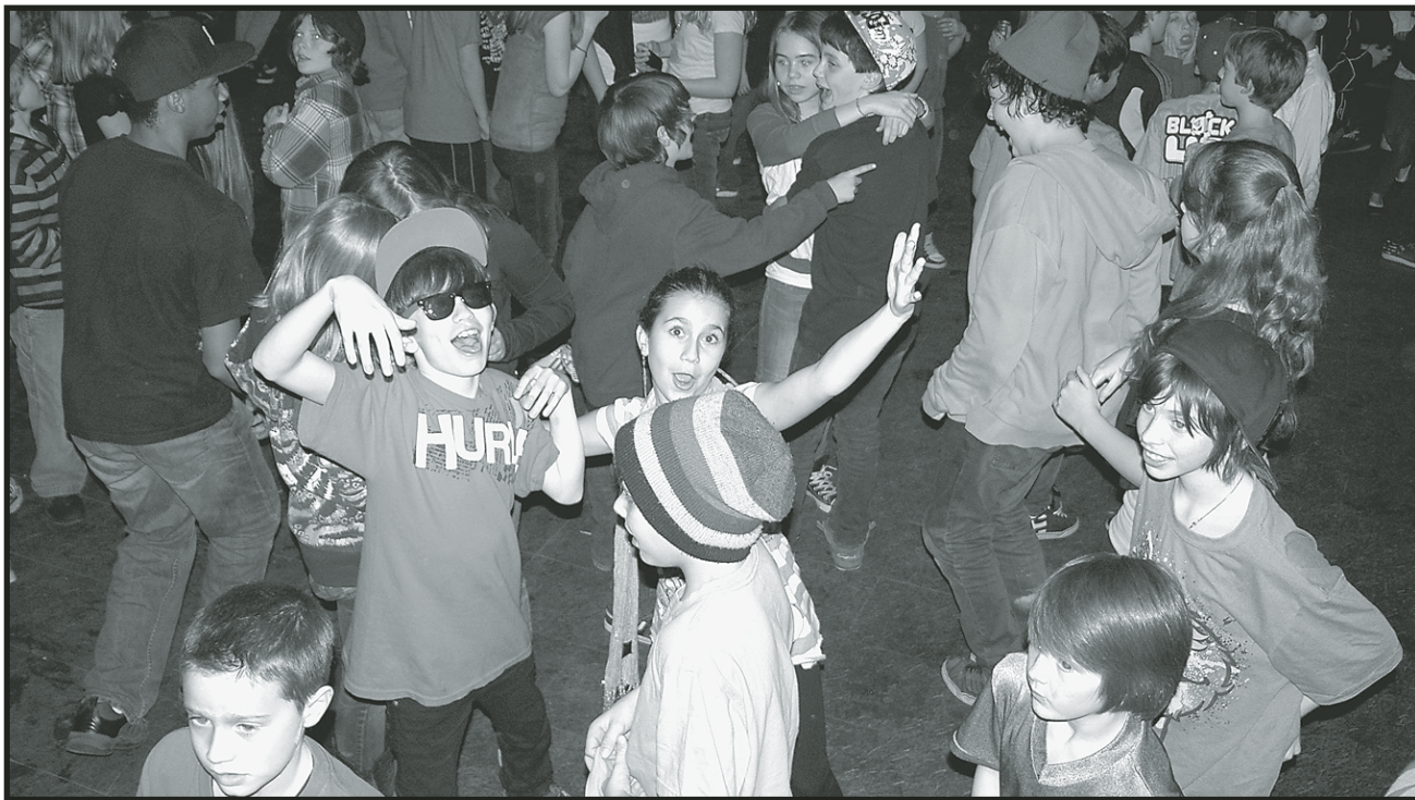
ROXY RAVE: The dance floor was packed with energetic youth at a video dance party at the Roxy on Friday.

"Serving your health needs, Naturally, since 1977"