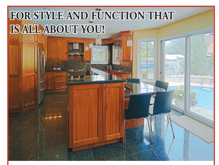
We provide top quality custom cabinets & countertops at competitive rates with unsurpassed service. *FREE ESTIMATES*

CALL 905.702.1247 TODAY PROUDLY SPONSORED BY BENNETT HEALTH CARE CENTRE VISIT US ONLINE AT BENNETTVILLAGE.CA