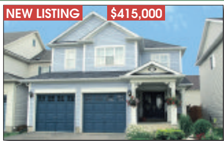
NEW LISTING $415,000

A great multi family home or investment property. Located in rural Brampton on 1.33 acres, with a gorgeous view of gently rolling hills & nature at it's best. With 5,335 sq ft of living space plus walkout basement, 6 car garage, 4 fireplaces, large deck across rear of house, 2 circular oak staircases & much more, the possibilities are endless. We look forward to telling you more. Call the Dusk Team today.