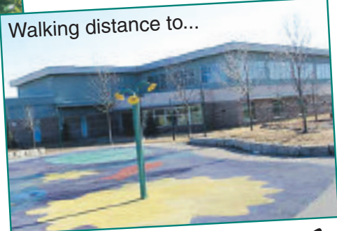
Walking distance to...

Unbelievable!!! What R U waiting for?? Wake up!! Smell the Coffee!