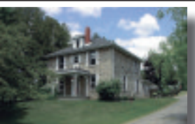
72 ACRE HOBBY FARM

Located @ 5835 Wellington Rd 26. This 72 acre hobby farm boasts remodeled 3 bed, 3 bath, stone house. Large 4 bay garage w/sep in-law suite / apartment. 3 other barns, 50 workable, very picturesque setting.