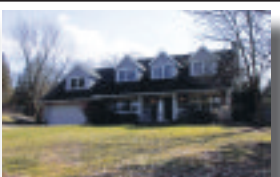
36 ACRE ESTATE / EQUESTRIAN FACILITY

Incredible setting describes this 38 acre estate located at 5784 Fifth Line, Eramosa. 3000 sq ft home, 6 stall barn, indoor arena, paddocks etc.