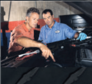
Finding the right specialist for your car means keeping your eyes and ears open.