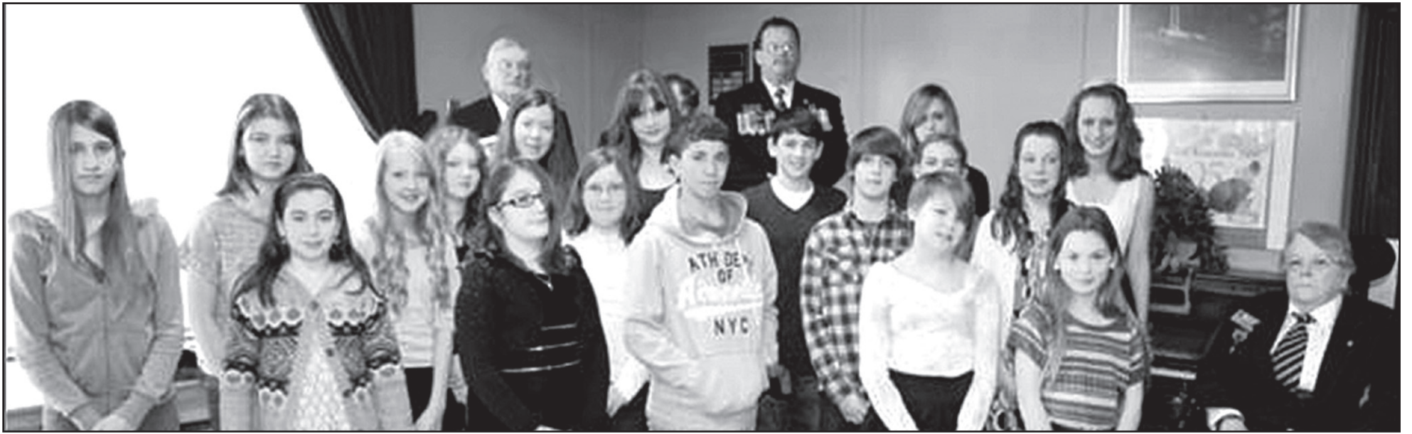
CONTEST WINNERS: Some of the Acton students whose submissions earned prizes in the Acton Legion's annual Remembrance Day Poppy poster contest picked up their awards on Sunday at the Acton Branch.