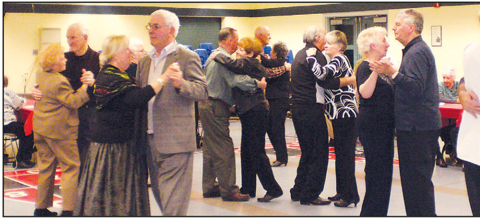
SHALL WE DANCE? The dance floor was full on Monday as members of the Acton Senior's Centre ushered in the New Year with a dance.