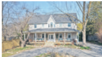
LIMEHOUSE FAMILY HOME $629,900