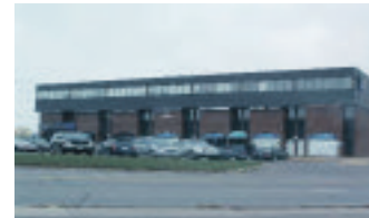
PRIME OFFICE SPACE IN HEART OF TOWN $12.75/Sq Ft