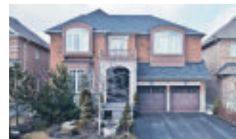
MOVE IN READY $830,000

www.PresswoodTeam.com 12-014 W2266576/W2278065