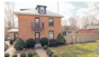
BACKS ONTO BABBLING STREAM $435,000

www.HaltonHillsRealEstate.com 12-028 W2227983