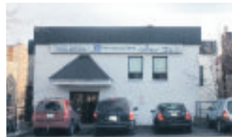
OFFICE SPACE FOR LEASE $790-$830/Month

www.PresswoodTeam.com 12-017 W2266672/W2266676