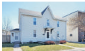
PERIOD HOME ON THE BOWER $333,000

www.PresswoodTeam.com 11-479 W2237664/W2237665