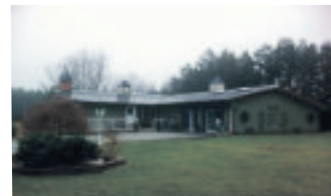
5 BDRM BUNGALOW-10 ACRES-HILLSBURGH $925,000

www.PresswoodTeam.com 12-017 W2266672/W2266676