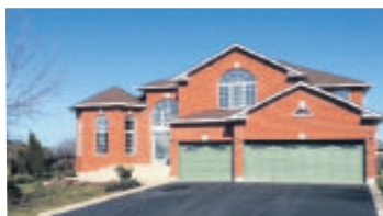
BIG HOME! BIG LOT! $724,000