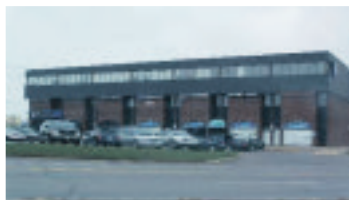
PRIME OFFICE SPACE $13.75/Sq.Ft.

www.HaltonHillsRealEstate.com 12-067 W2289858