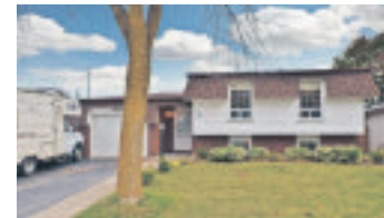
MOVE-IN GEM IN QUIET NEIGHBOURHOOD $279,900