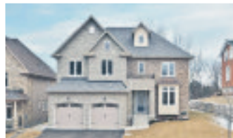
3,913 SQ.FT. CUSTOM EXECUTIVE HOME $1,150,000