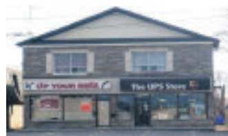
LOCATION! LOCATION! LOCATION! $2,300/Month