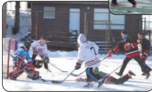
LEFT: The Bantam A team faces off in a game of ball hockey.