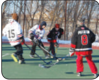
BELOW: The Minor Bantam AA team scrambles for the ball.

Local hockey fans celebrated Hockey Day in Canada by stepping off the ice and onto the tennis courts beside the Mold-Masters SportsPlex for a little ball hockey. Players of all ages from the Georgetown Minor Hockey Association's rep teams faced off in a series of fun games as part of the Canada-wide hockey party. The event was also part of the GMHA's on-going 75th anniversary celebration.