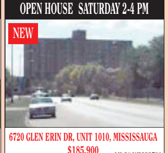
$185,900 MLS# W2332780