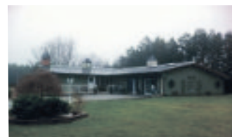
5 BDRM BUNGALOW-10 ACRES-HILLSBURGH $925,000

www.PresswoodTeam.com 12-017 W2266672/W2266716