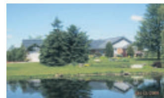
11 ACRES - CLOSE TO 401 $1,375,000

www.HaltonHillsRealEstate.com 12-034 W2277850