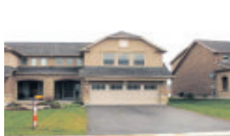
CHARLESTON HOME - FIN TOP TO BOTTOM! $499,900