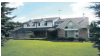
GORGEOUS CUSTOM BUILT 3500 SQ FT HOME $899,900