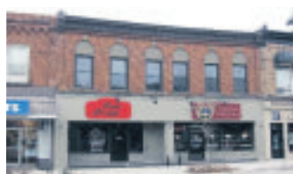
BRAND NEW 2ND FLOOR OFFICE SPACE $1,600/Month