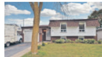
MOVE-IN GEM IN QUIET NEIGHBOURHOOD $289,000