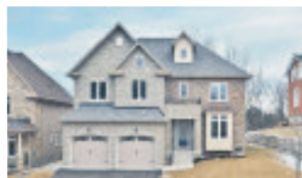
3,913 SQ.FT. CUSTOM EXECUTIVE HOME $1,150,000