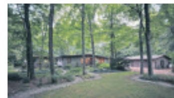
GORGEOUS TREED LOT IN LIMEHOUSE $799,000