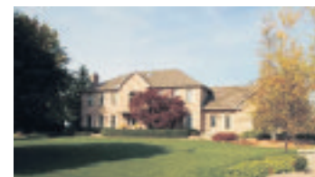
THE ESSENCE OF ELEGANCE! $1,549,000

www.HaltonHillsRealEstate.com 12-067 W2289858