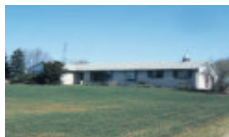
OPPORTUNITY KNOCKS - 10 ACRES $1,199,000

www.HaltonHillsRealEstate.com 12-034 W2277850