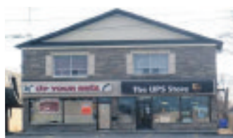
LOCATION! LOCATION! LOCATION! $2,300/Month