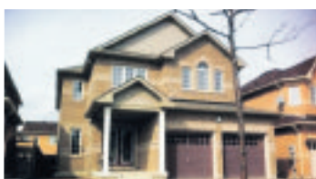
4+1 BDRM W/PROF FINISHED BASEMENT $649,900