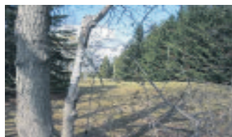
1 ACRE BUILDING LOT $244,000