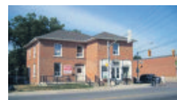
RENOVATED COMMERCIAL/RETAIL UNIT $995/Month