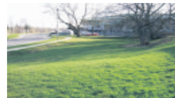
WHAT A DEAL THIS PROPERTY IS! $95,000