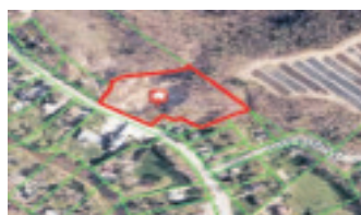
2.9 ACRE GLEN WILLIAMS BUILDING LOT $479,000