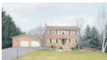
ESTABLISHED ESTATE "COURT" LOCATION $684,900