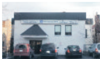
OFFICE SPACE FOR LEASE $790-$830/Month

www.PresswoodTeam.com 12-017 W2266672/W2266716