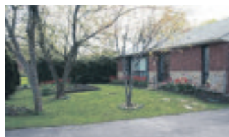
UPDATED BUNGALOW-FAMILY FRIENDLY STREET $368,973

www.PresswoodTeam.com 11-479 W2237664/W2237665