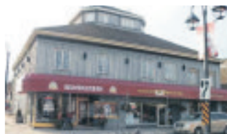
DOWNTOWN PROFESSIONAL OFFICES $325 To $2,700/Month

www.PresswoodTeam.com 12-010 W2266583/W2266628/W2266650/W2266542