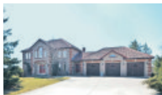
BALLINAFAD BEAUTY! $1,190,000