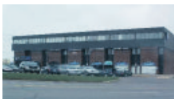
PRIME OFFICE SPACE $13.75/Sq.Ft.

www.HaltonHillsRealEstate.com 12-067 W2289858