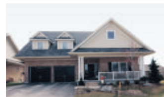
GORGEOUS NEW HOME $589,900