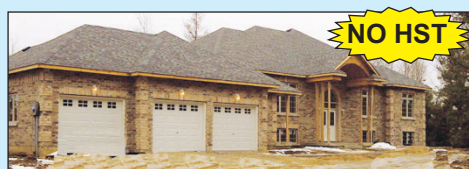
PRIVATE GREEN OASIS WITH SHOW STOPPER BUNGALOW! $899,900

Minutes from town & GO Train, a perfect hobby/horse farm or nature lover's retreat with ultimate privacy provided by majestic trees, 2 ponds, lovely gardens & a steel barn with 3 paddocks. Sprawling 3+2 bedrooms, 3 baths bungalow with lots of updates including replaced windows & exterior doors, furnace & much more. Bright totally finished lower level with front & rear walkouts with loads of space for nanny, in-laws, home office or additional living space. Includes appliances & a riding lawn mower. Fantastic value for this gorgeous property. Close to 2 golf courses.