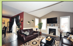
SHOWSTOPPER 2 YRS NEW EXECUTIVE $699,900

Impressive beyond words & luxuriously appointed with quality upgrades including hand scraped hardwood thruout entire house! Soaring cathedral/coffered ceilings, upgraded baseboards, wainscoting, mouldings, trim at every turn. Gorgeous gourmet kitchen with granite & split stone counter accent. Modern open concept layout with a great room having cathedral ceiling & a gas fireplace. Separate formal living room for those special gatherings. Upgraded stairs lead to a magnificent marble ensuite fit for royalty & a massive walk-in closet. Convenient 2nd flr laundry is a real bonus. This home must be seen to appreciate the superb quality thruout.