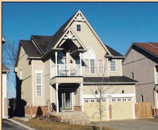
44 MEADOWGLEN BLVD. $629,900

Amazing Courtyard Design that'll blow your socks off...siding onto large evergreen trees and a brand new bungalow on the other side! Brand New...Over 2200 Square Feet of quality finishes on 1/2 acre. Town water, gas & cable...doesn't even feel like country yet you have the space. Fabulous open concept bungalow floor plan with granite countertops, solid raised panel maple kitchen cabinetry, 9 foot ceilings, gas fireplace, hardwood, berber, all brick, vinyl casement windows, triple car garage! Move in August/September!