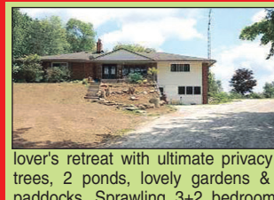
SPECTACULAR 8.6 ACRES IN HALTON HILLS $575,000

JUST SOLD Get the Most Experience Working For You.