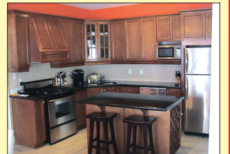
LUXURY FINISHES, COUNTRY LIVING, BUT WALK TO DOWNTOWN $649,900

Amazing Courtyard Design that'll blow your socks off...siding onto large evergreen trees and a brand new bungalow on the other side! Brand New...Over 2200 Square Feet of quality finishes on 1/2 acre. Town water, gas & cable...doesn't even feel like country yet you have the space. Fabulous open concept bungalow floor plan with granite countertops, solid raised panel maple kitchen cabinetry, 9 foot ceilings, gas fireplace, hardwood, berber, all brick, vinyl casement windows, triple car garage! Move in August/September!