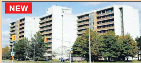
2301 DERRY RD., MISSISSAUGA

JUST SOLD Get the Most Experience Working For You.