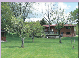
APPROX. 1 ACRE VERY NEAT LAYOUT WITH GREAT ACCESS TO TOWN! $559,900

Sprawling, 4 bdrm California style bungalow features a unique layout with massive principal rooms having soaring cathedral ceilings, 2 floor to ceiling fireplaces, lovely newer kitchen, gleaming hardwood floors, all replaced windows, roof (2005), 200 amp service, high speed internet & freshly painted thruout. Convenient main floor laundry and brand new powder room. Gorgeous mature landscaping, tandem 4 car garage and a long driveway that holds a dozen cars. Excellent location - only 15 minutes to 401 and walk to GO train.