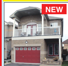
DESIRABLE HOME IN GEORGETOWN SOUTH $474,900

OPEN HOUSE SUN. 2-4 P.M. - 156 MEADOWLARK DR.