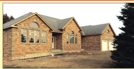
9500 WELLINGTON 124 ERIN $599,900

Sprawling, 4 bdrm California style bungalow features a unique layout with massive principal rooms having soaring cathedral ceilings, 2 floor to ceiling fireplaces, lovely newer kitchen, gleaming hardwood floors, all replaced windows, roof (2005), 200 amp service, high speed internet & freshly painted thruout. Convenient main floor laundry and brand new powder room. Gorgeous mature landscaping, tandem 4 car garage and a long driveway that holds a dozen cars. Excellent location - only 15 minutes to 401 and walk to GO train.