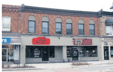
BRAND NEW 2ND FLOOR OFFICE SPACE $1,600/Month