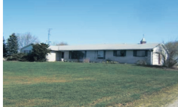
OPPORTUNITY KNOCKS - 10 ACRES $1,199,000

12-034 W2277850 www.HaltonHillsRealEstate.com