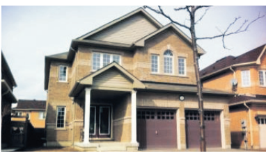
4+1 BDRM W/PROF FINISHED BASEMENT $665,000