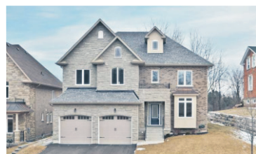
3,913 SQ.FT. CUSTOM EXECUTIVE HOME $1,150,000