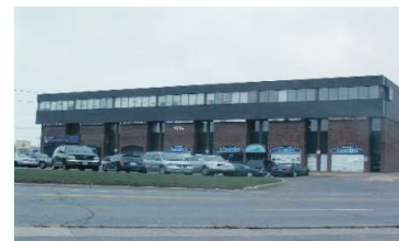
PRIME OFFICE SPACE IN HEART OF TOWN $12.75/Sq Ft