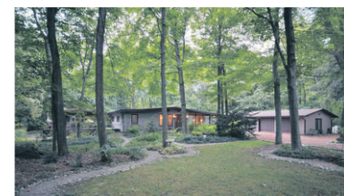
GORGEOUS TREED LOT IN LIMEHOUSE $799,000