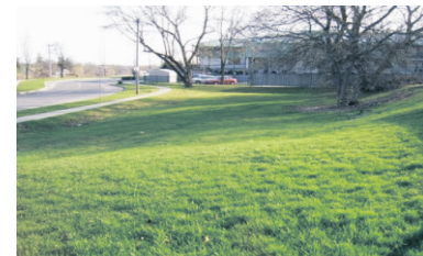
WHAT A DEAL THIS PROPERTY IS! $95,000