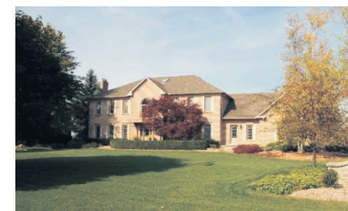
THE ESSENCE OF ELEGANCE! $1,549,000

12-060 W2286707 www.HaltonHillsRealEstate.com