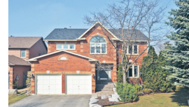
4 BDRMS W/FINISHED BASEMENT ON GREAT LOT $679,900

12-028 W2237983 www.HaltonHillsRealEstate.com