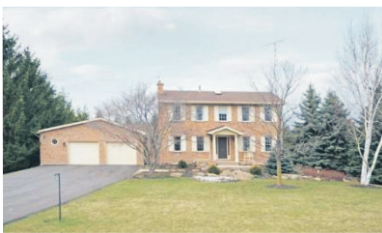
ESTABLISHED ESTATE "COURT" LOCATION $684,900