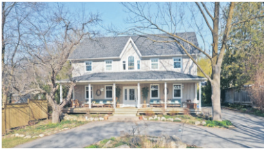
LIMEHOUSE FAMILY HOME $649,900