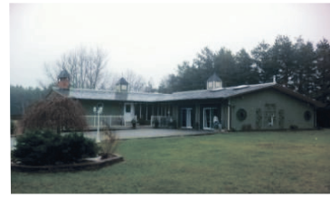
5 BDRM BUNGALOW-10 ACRES-HILLSBURGH $925,000

12-017 W2266672/W2266716 www.PresswoodTeam.com