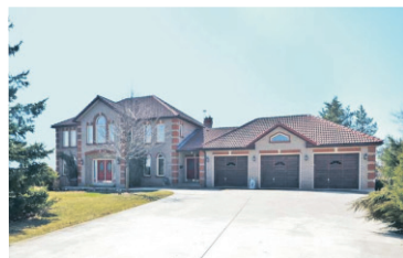
BALLINAFAD BEAUTY! $1,190,000