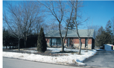
UPDATED BUNGALOW-FAMILY FRIENDLY STREET $374,978

11-479 W2237664/W2237665 www.PresswoodTeam.com