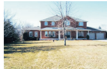
CUSTOM HOME - 1+ ACRES $739,900

12-060 W2286707 www.HaltonHillsRealEstate.com