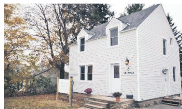
ZONED RESIDENTIAL & COMMERCIAL $525,000

12-090 W2302256/W2302229 www.haltonhomes.com