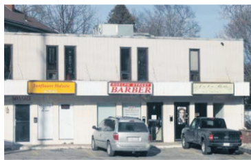
PRIME RETAIL - 2 UNITS FOR LEASE $720/Month to $850/Month

12-010 W2266583/W2266628/W2266650/W2266652 www.PresswoodTeam.com