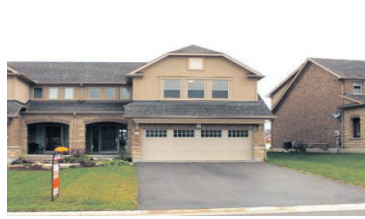
CHARLESTON HOME - FIN TOP TO BOTTOM! $499,900