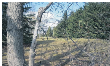
1 ACRE BUILDING LOT $244,000