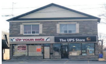
LOCATION! LOCATION! LOCATION! $2,300/Month

12-090 W2302256/W2302229 www.haltonhomes.com