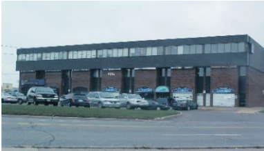
PRIME OFFICE SPACE $13.75/Sq.Ft.

12-067 W2289858 www.HaltonHillsRealEstate.com