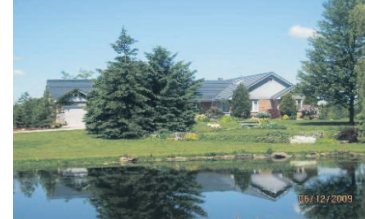
11 ACRES - CLOSE TO 401 $1,375,000

12-034 W2277850 www.HaltonHillsRealEstate.com