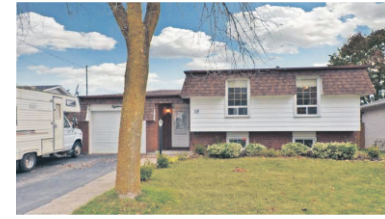
MOVE-IN GEM IN QUIET NEIGHBOURHOOD $289,000