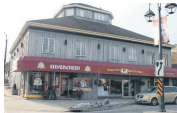
DOWNTOWN PROFESSIONAL OFFICES $325 To $2,700/Month

12-010 W2266583/W2266628/W2266650/W2266652 www.PresswoodTeam.com