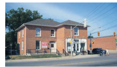
RENOVATED COMMERCIAL/RETAIL UNIT $995/Month