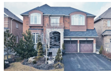
MOVE IN READY $845,000

12-014 W2266576/W2278065 www.PresswoodTeam.com