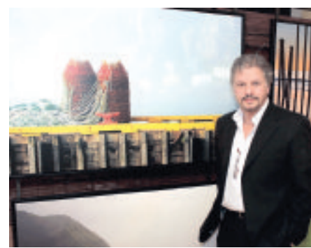
Photography Studio C in the Yellow Mill Building.

Exhibit One: Terra Cotta Journey is a perception of nature and the changing seasons. Photographer Manny Martins has captured 52 photographic images over a one-year period with one image denoting each week of the year. The Terra Cotta Conservation Area, part of the Credit Valley Conservation, forms the inspiration for this outstanding natural photographic image collection. The images will be on display from March 21 to April 22 in the Mar Blue